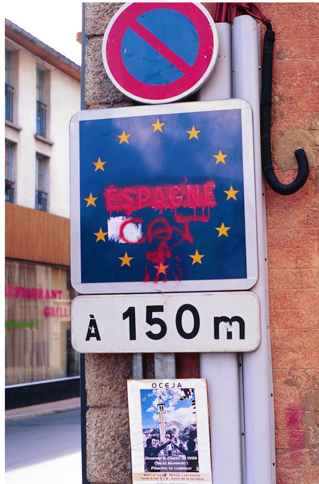
Figure 3. A signpost written over at a border crossing point of la Guingueta d'Ix in Cerdanya valley (Photo by J. Häkli, 1999).

Identity was one of the most used and least theorised catchwords of the cultural studies literature of the 1990's (Paasi & Häkli, 2001). It is still frequently used in attempts to understand the multi-layered and sometimes overlapping feelings of community and belonging in various social and spatial groups. While identity is a useful concept for discussing spatial group formation, it should be kept in mind that the word in itself explains little. Rather, the concept of identity can be seen as a constituent part of the very discourses that form imagined communities. For example, the government of Catalonia frequently makes reference to the 'Catalan identity' in official texts and publications, and undoubtedly does so in an attempt to reinforce the sense of 'Catalanness' among the population (Guibernau, 1997).