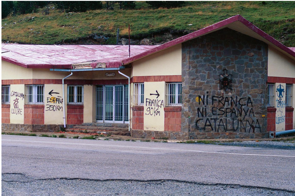
Figure 2. Now defunct border crossing point on the Coll d'Ares (Photo by J. Häkli, 1999)

Hence, the border-crossing points located in the mountain valleys of Cerdanya, Coll d'Ares, Coll del Portús, and Coll de Belitres make up a perfect location for the insertion of nationalist symbolism. Slogans like “neither France nor Spain”, “free Catalonia”, or signposts with Spanish and French names written over and replaced with Catalan names are typical elements in the Catalan border landscapes (Figures 2 and 3). Not even the sign of the French region of Languedoc-Roussillon is left untouched, as it is reminiscent of a provincial division originating in the French state, rather than the Catalan tradition. For Catalan nationalists the region is Catalunya Nord, or in French, Rossello.