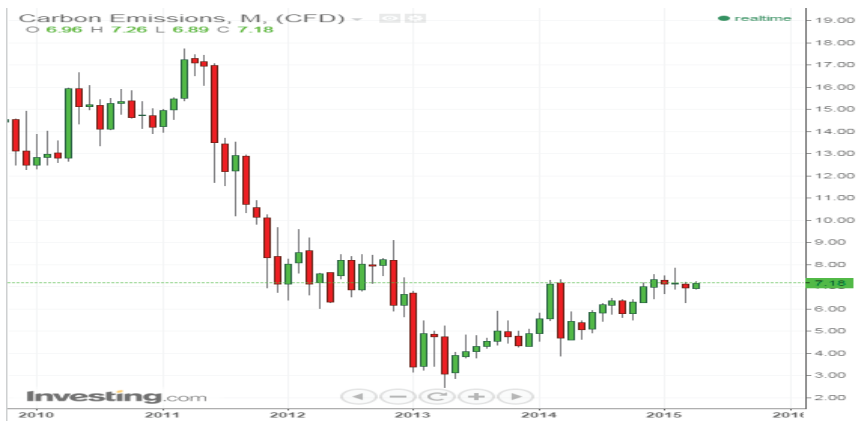
Figure 2. The prices of emission permits in the period 2010-2015

Source: Investing. Com, Carbon Emissions Streaming Chart, http://www.investing.com/commodities/carbon-emissions-streaming-chart