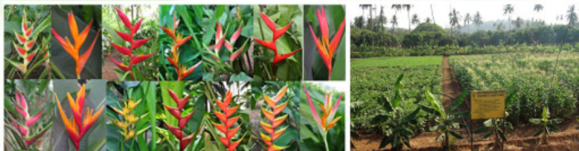
Heliconia flower production technology and Integrated farming system models for Goa state