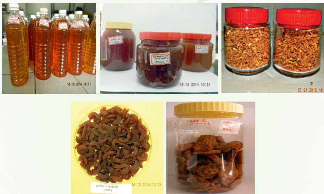
Nutmeg pericarp syrup, jam, mouth freshener, candy and cashew apple crunch are important value-added productions of nutmeg and cashew as an alternate source of income to farmers