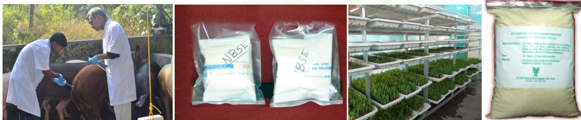
Artificial Insemination in pigs, Boar semen extender, Hydroponic fodder and Bypass fat to increase the livestock production in Goa state