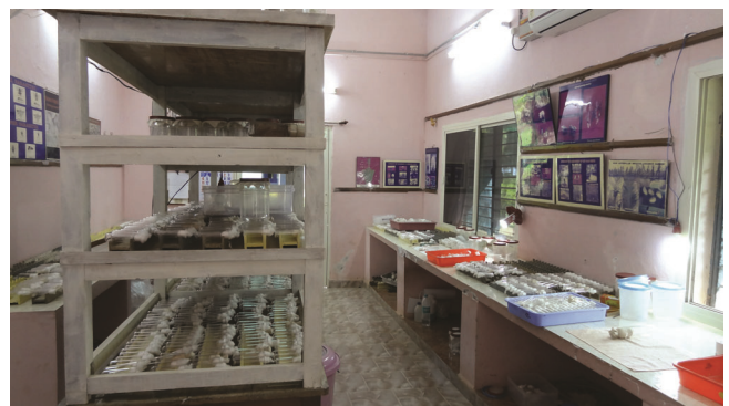
Figure 5. Bio Control Laboratory HRS, Ambajipeta.