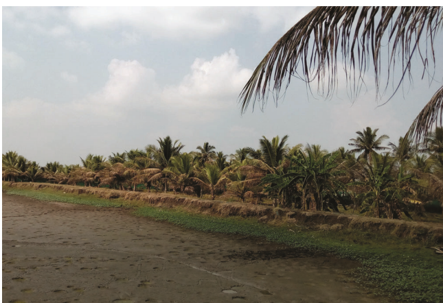
Figure 3. Coconut palms on fish pond bunds infested with black headed caterpillar.

centre (Hyderabad) and M/s Noveel Coconut Producer Company (Amalapuram) conducted an experiment through large scale inundative releases of the bio agents G. nephantidis and B. hebetor (Figures 4 and 5). The field release programmes in the affected mandals were carried out through coconut producer societies formed in villages and operating under M/s Noveel Company. The Samanthakurru, Mogallamuru, Thrupulanka, Godilanka and Bendamurlanka villages in Allavaram mandal and N. Kothapalli and Challapalli in Uppalaguptam mandal were selected to study the impact of this biological control programme (Table 1).