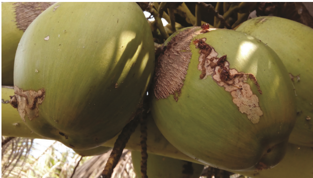
Figure 1. Coconut black headed caterpillar infestation on coconut bunches.

coconut trees and sole coconut garden were affected by the pest. To study the impact of biological control in reducing pest population in the outbreak affected villages and contain the spread of pest to neighbouring coconut growing mandals, H.R.S., Ambajipeta (under AICRP on Palms), Dr Y.S.R. Horticultural University in association with the Department of Horticulture, Government of Andhra Pradesh, Coconut Development Board state