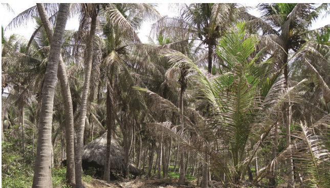
Figure 2. Black headed caterpillar infested coconut garden.