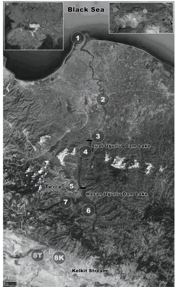
Figure 1. The study area and sampling sites.

This study was performed in the lower basin of the Yeşilirmak River. The study area contained 2 dam lakes, Suat and Hasan Uğurlu, as well as the river sections below and above the dam lakes (Figure 1). Originating at Köse Mountain to the east, the Yeşilirmak River continues to flow through Canik