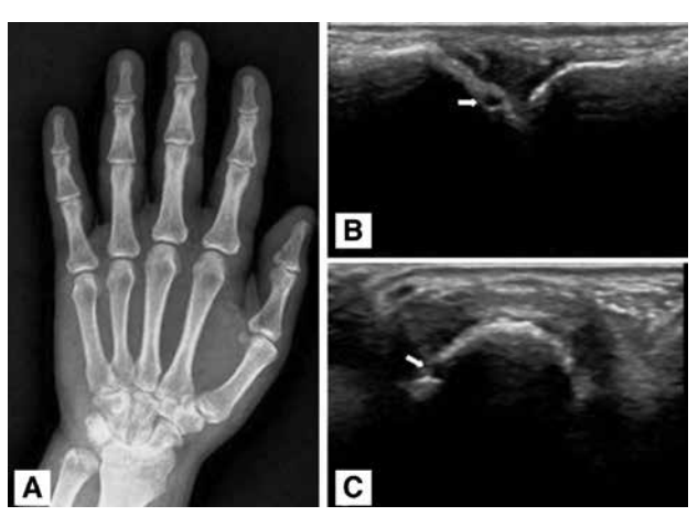
Figure 1. Anteroposterior hand&wrist radiograph showing soft-tissue swelling without erosion (A), longitudinal (B) and axial, (C) ultrasound image cortical bone erosion on radial side of the 2<sup>nd</sup> metacarpophalangeal joint (arrow)

A 55-year old male presented to the outpatient clinic with painful swelling and morning stiffness in both wrists and finger joints which had started 6 weeks ago. The morning stiffness in both hands and wrists lasted for up to 2 hours and improved with activity. Detailed questioning revealed no significant past medical history. On physical examination, there was deformity and swelling on the wrists and hands. Soft-tender swellings were determined in the metacarpophalangeal (MCP) and proximal interphalangeal joints of the second through fifth digits of both hands. The serum C-reactive protein (CRP) level, anti-CRP level and erythrocyte sedimentation rates (ESR) were increased (CRP=68 mg/L; ESR=87 mm/h; anti-CRP=364 UI/ mL). Rheumatoid factor levels were within the normal ranges. The leukocyte count, hepatitis markers, anti-nuclear antibodies, anti-dsDNA were also normal. Antero-posterior hand and wrist radiographs showed soft tissue swelling without erosion (Figure 1a). Longitudinal (Figure 1b) and axial (Figure 1c) ultrasound (US) images showed effusion, and cortical bone erosion on the radial side of the 2<sup>nd</sup> MCP joint (arrow).