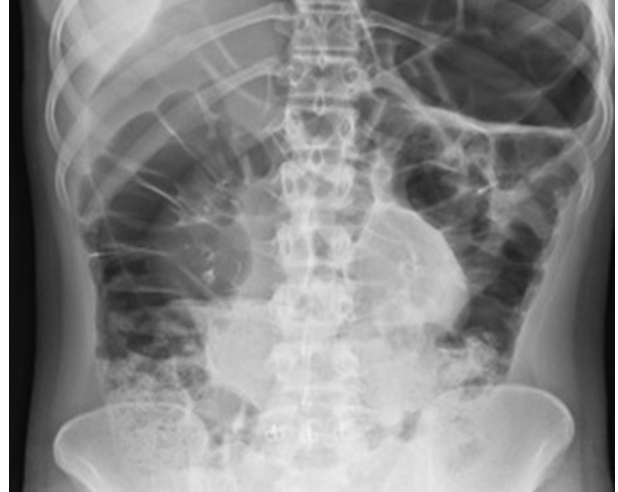
Figure 1. Dilated Colon Segments on Abdominal X-ray

On the patient who underwent laparotomy it was seen that sigmoid colon rotated 2 times around its mesentery and the effected segment showed dilatation and edema. There was not any ischemia and necrosis (Figure 3). Sigmoid colon was detorsioned and upon finding, it was longer than normal, resection of sigmoid colon and end colostomy (Hartmann Procedure) operations were performed. Patient, who did not develop any complications on post-operative follow-ups, was discharged on 5 th day.