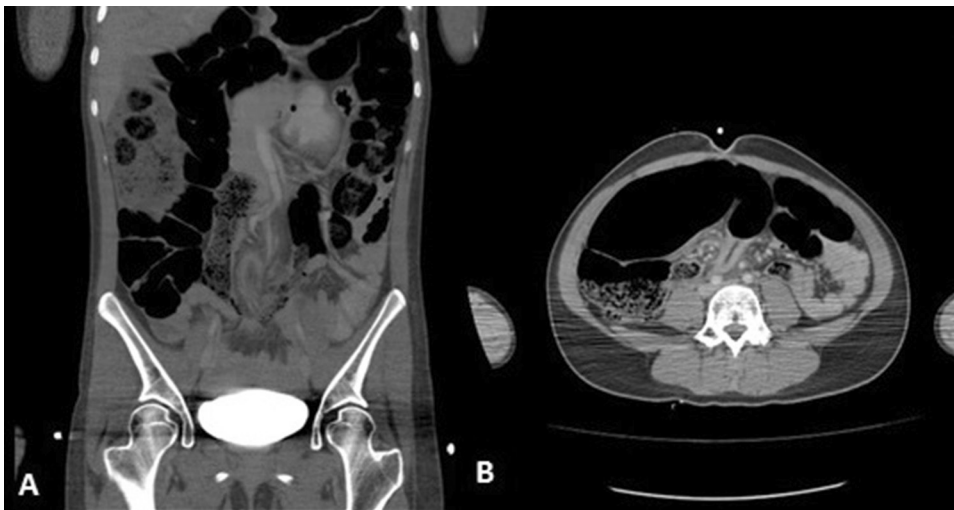
Figure 2. A. Sigmoid Volvulus Observed on Axial Cross-Section with CT B. Sigmoid Volvulus Observed on Transverse Cross-Section with CT