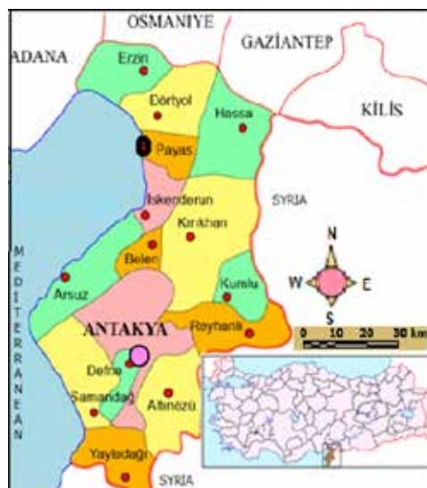
Figure 1. Research area

moistened with distilled water 24 or 48 hours (In winter 24 hours, summer 48 hours). When developing myxomycetes were found, the moist chamber was allowed to dry slowly and the myxomycetes were then dried for one week. (Stephenson and Stempen, 2000; Baba, 2012).