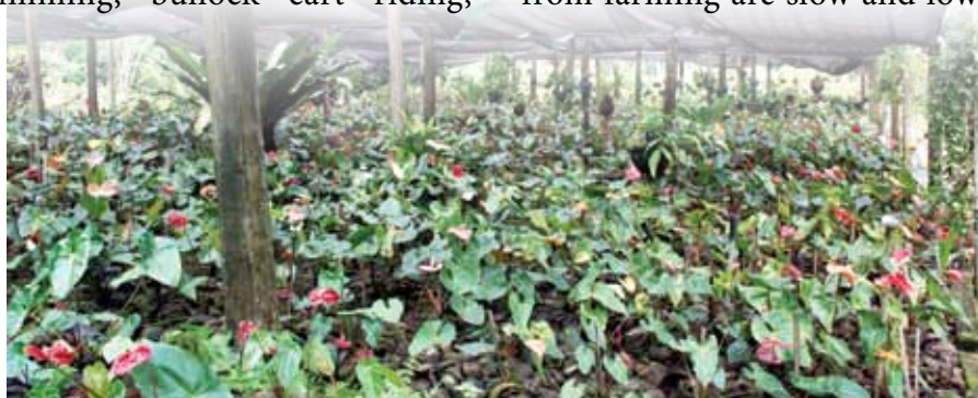
Agro-tourism centres can be source of quality plating material

We all know majority of our country lives in the rural areas. And in these rural areas the activities such as agriculture, forestry, and fishery are the means of livelihood. According to Dr. M.S. Swaminathan agrarian activities will be the only sector for this country which will provide major job opportunities for youth. We all have noticed that the outlook of the present policy on Agriculture by the central government is focused on these areas. At the same time we all have observed excesses of modern agriculture technologies causing damages to the local ecology. The returns from farming are slow and low of which