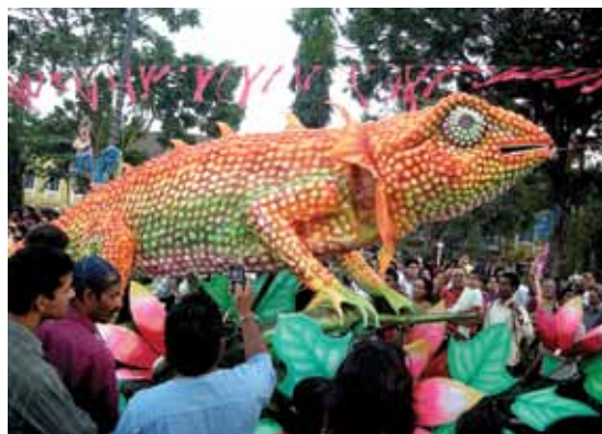
CARNIVAL IN GOA: A tourist attraction