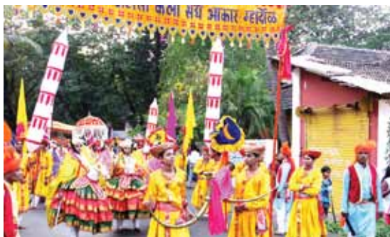
SHIGMO: A popular festival in Goa

Sal and Talpona, flow windingly through villages and give support to the local economy, either for agriculture or for fishing. Sight seeing can be done from the water instead of the road. The inland cruises could have landing points near the spice gardens, churches and temples so that the tourist can see the important places too along with the scenic river trip.