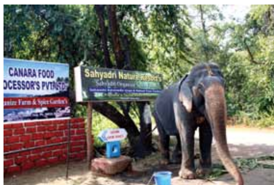
Elephant ride for amusement

In order to make tourism more attractive, appealing, natural, aesthetic, nutritionally sound reflection of natural resources with various technological