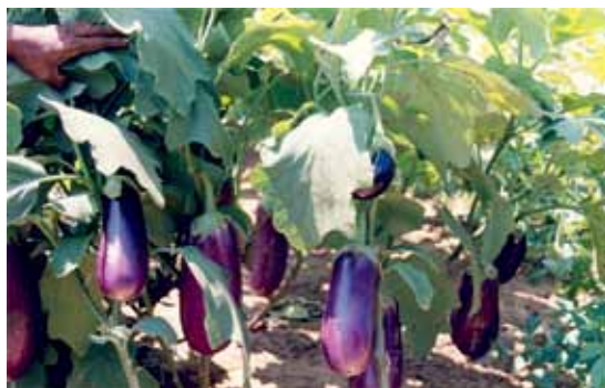
Vegetables grown at agro-tourism unit

Organic farming or natural farming is the principle of all these gardens. Such gardens are invariably located in valleys with perennial water streams or in the areas adjoining the rivulets and aim at taking the visitors to the natural destinations. Spice crops are the destinations in these Agro-eco farms for the visitors especially the Western or European tourists in Goa. Visitors include school children as well, for whom these gardens offer opportunity to learn and enrich the knowledge about spices and their importance. Tropical spice crops as Kokum, black pepper, clove, nutmeg, cinnamon, cardamom, allspice, vanilla, etc coupled with native fruit crops like mango, banana, jack fruit, bread fruit, etc., are incorporated in palm based farming systems or agro-forestry systems with specific orientation towards agro-eco tourism. These gardens provide the tourists or the visitors single window opportunity