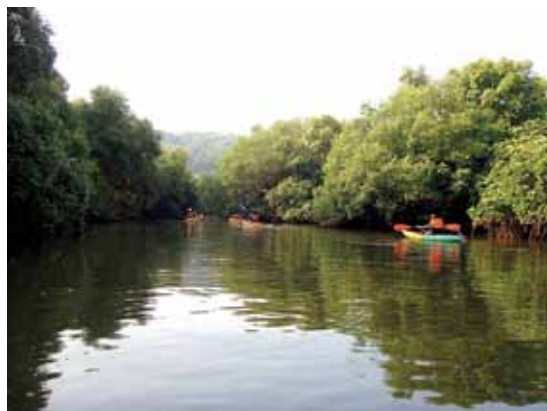
Mangroves and backwater

are many other beautiful churches and temples all over Goa. A few kilometers away from