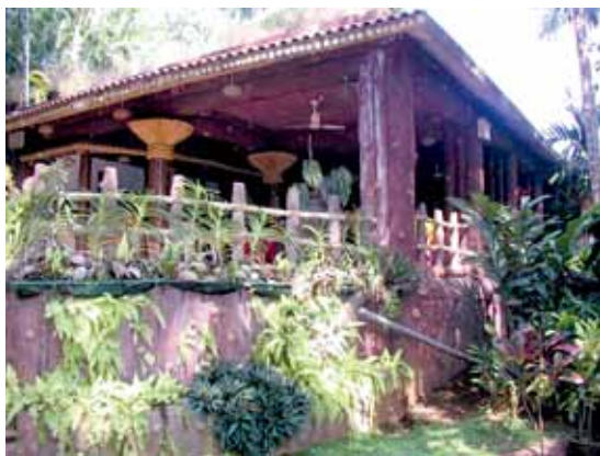
Restaurant at an agro-tourism unit

Agro-eco tourism can bring about many more added benefits in rural areas by way of assisting farming and other rural families to use existing resources effectively in order to improve income and the viability of the farm business, providing interactive opportunities to the villagers with national and international tourists right in their own places thereby enhance understanding of the outside world, improving the infrastructure facilities and standards for tourists and local people, enriching the heritage and culture of the region, increasing foreign currency earning through “Rural Windows” and bringing about overall transformation of rural sectors into active functional centres.