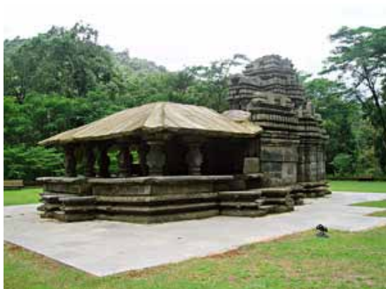
Tambadi Surla Temple