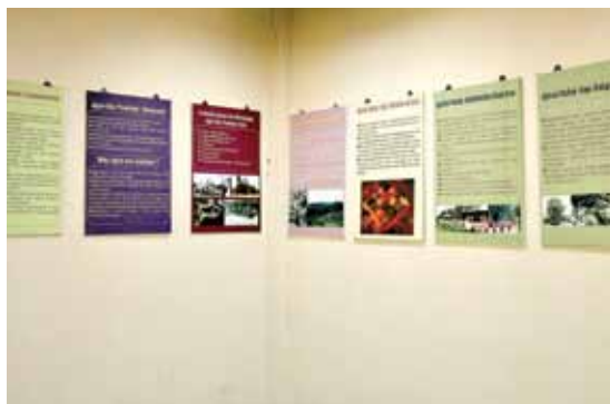
View of Agro-Eco-tourism cell