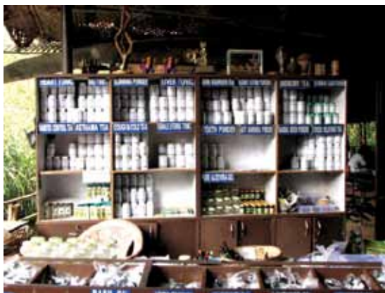
Spice products for sale at agro-tourism unit