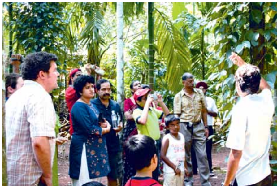
Guided tour to the farm

The survey of the existing units revealed critical aspects of looking at agro-eco