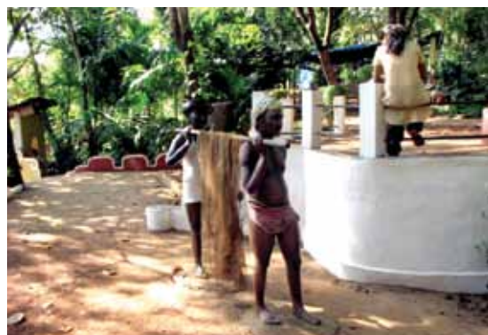
Model displaying rural activities

The third dimension, in the agro-eco-tourism, is the tourism. The International