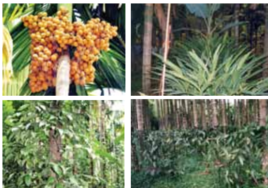
Arecanut based cropping systems