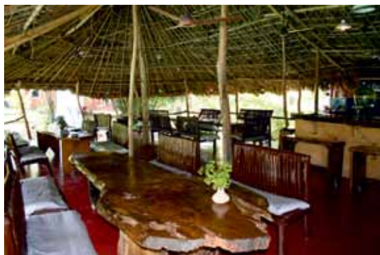
View of restaurant