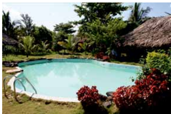
Swimming pool at agro-eco-tourism unit