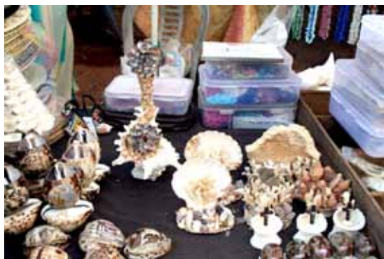
Rural artisans at display

The constant instability of net farm incomes and the loss of jobs in rural