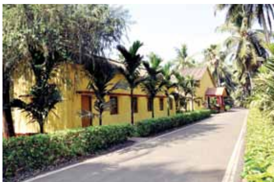
Facilities for Agro-tourism promotion at the Institute