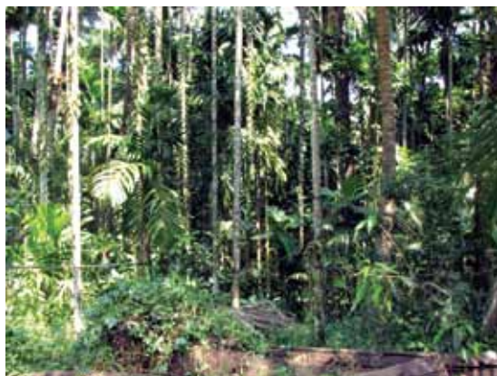
Multistoreyed cropping in agro-tourism unit

Agro-eco-tourism is the new value added agricultural business, for improving the incomes and potential economic viability of small farms and rural communities. Agri-tourism can take many forms like roadside stands or on farm direct sales, which can offer farm-fresh produce to travelers as well as interaction with growers. Agri-tourism ends farmers' isolation and offers the opportunity to make new friends and build stronger links to the community. Social skills and a scenic, clean, attractive farm are crucial for success in agri-tourism and can make the farms more ideal location for tourists.