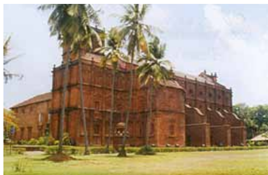
Basilica of Bom Jesus