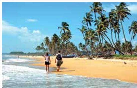
A view of beach in Goa

area is protected area. Around 1.25 lakhs tourist visit these sanctuaries every year. Goa has a variety of flora and fauna which could be used to attract tourists to these places. Goa also has two beautiful lakes, at Mayem and Carambolim, where migratory birds are sighted in large numbers.