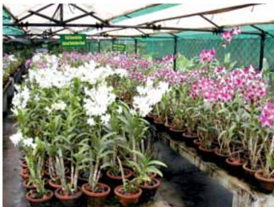
Orchids for display and sale

to see, observe, and aesthetically enjoy the wealth of spices in their natural habitat in the back drop of lush- green-forest covers with natural scenic beauty. Here visitors can not only breathe fresh air but also feel the fresh aroma of spices in their natural forms and can get the fresh, pure, organically grown spices and spice products. These gardens also function as health resorts for which visitors attach utmost importance, especially, those who come from the hustle and bustle of the metropolitan / cosmopolitan mechanical urban life. Curative function to overcome the