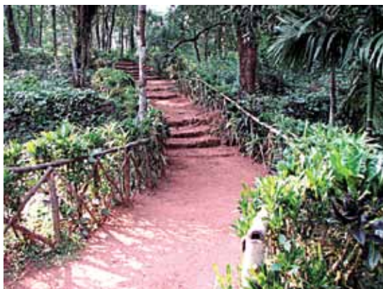
Trail in spice garden

aspects of agriculture will be important components of agro-eco-tourism. These components will require developing either as main center or as sight scene of tourism activities. The following potential technological components are identified suitable for establishment as a new unit or to exploit existing unit with some essential alteration or improvement in the agro-eco-tourism programme.