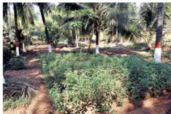
Vegetables grown at the Institute