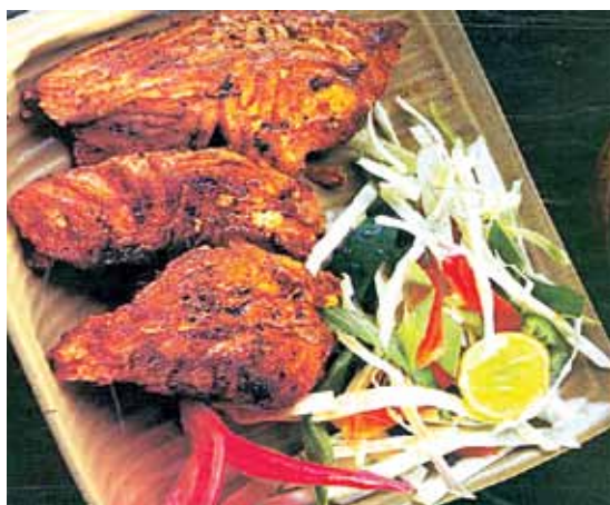
Local cuisine is an attraction

The major crop of the enterprise is coconut and coconut based multistoried cropping system. banana, areca nut, cashew, vanilla, black pepper, nutmeg, cinnamon, mango and other fruit crops like Sapota, Jackfruit Pineapple as well as medicinal plants were predominant. These crops primarily used as the sight for visitors to visit and get acquainted with its production