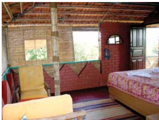
Accommodation at agro-tourism centre