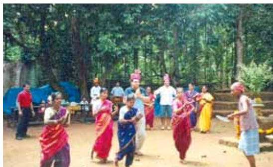
Folk dance being played

areas have led to a human and financial capital drain from many rural areas, leaving many farming families and businesses under economic stress. As has been realized already, agriculture alone can no longer be dependent upon to provide the economic stability for rural villages and communities. But the integration of tourism and agriculture activities will open up new vistas and can play key role as new employment partners for rural communities thereby improving the economic status. Besides this, Agro-eco tourism forms a potential “Alternative to routine tourism” which is “Farm based and harmonious with nature”.