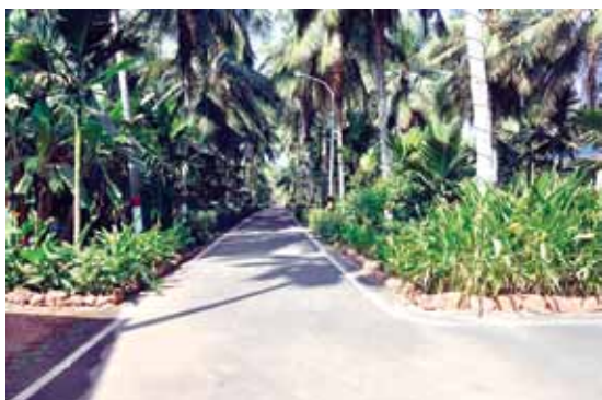
View of Agro-tourism unit at the Institute