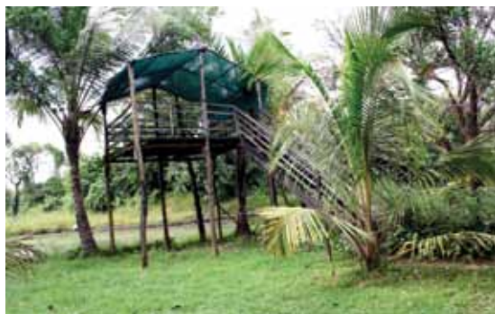
A watch tower at agro-tourism unit

The constant instability of net farm incomes and the loss of jobs in rural areas have led to a human and financial capital drain from many rural areas, leaving many farming families and businesses under economic stress. As has been realized already, agriculture alone can no longer be dependent upon to provide the economic stability for rural villages