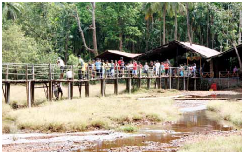
A view of bamboo bridge at agro-tourism centre

It gives you the opportunity to experience the real enchanting and authentic contact with the rural life, taste the local genuine food and get familiar with the various farming tasks during the visit. It provides you the escape from the daily hectic life in the peaceful rural environment. It gives