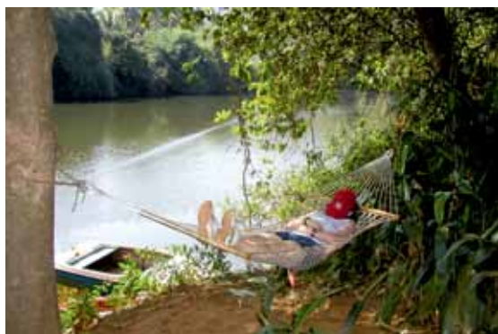
Relaxing by riverside