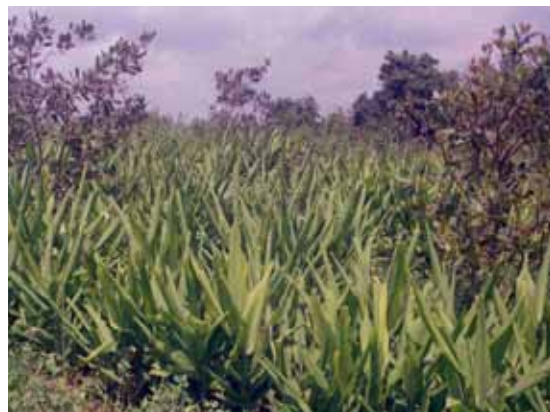
Cashew based cropping systems