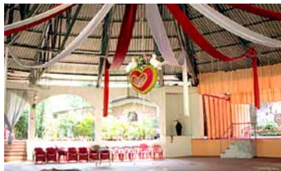
Place for meetings and parties