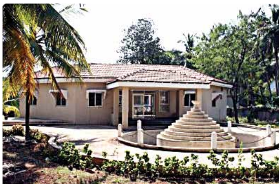
ATDC building at Institute premises