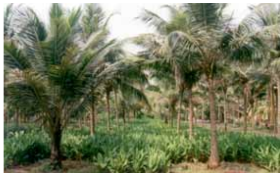
Intercropping in coconut garden

There is a great scope to develop and promote agro-eco tourism. The earlier thinking of beach based tourism is now fast changing with pressure on land (ON SHORE). The vast forest areas are being brought under cultivation of various agricultural/ horticultural crops due to alarming pressure on land in recent years.