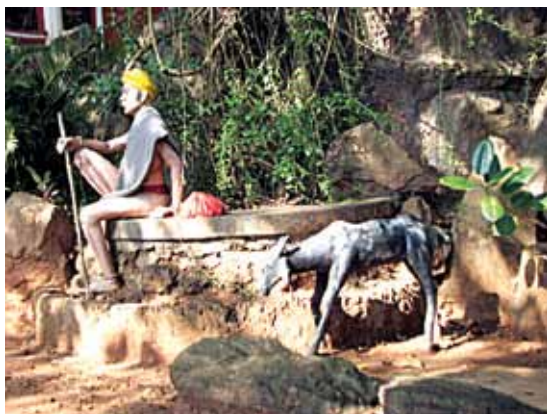
A view of ancestral Goa

in locations where tourism is growing rapidly, and where tourism offers an alternative source of income to traditional cultivation of crops and allied activities.