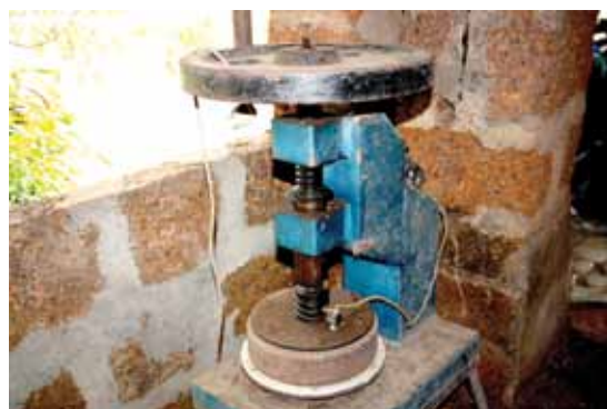
Old machinery at display

Hurdles in business: As there are no fix norms as in some other state of India for agro tourism due to which some people without having proper infra structure practicing agro-eco tourism centre spoils the reputation of agro-eco tourism.