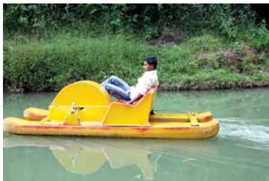
Tourist enjoying peddle boating

/ towns and communities. But the integration of tourism and agriculture activities will open up a new horizon and can play the key role as new employment partners for rural communities thereby improve the economic status. Besides this, agro-eco tourism forms a potential “Alternative to routine tourism” which is “Farm based and Harmonious with nature.