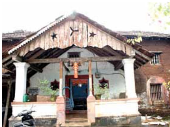
Old houses can be a part rural heritage

Employment generation: As people are required for maintenance of these agro eco tourism enterprises it has also generated some employment to locals. On an average twenty employments are