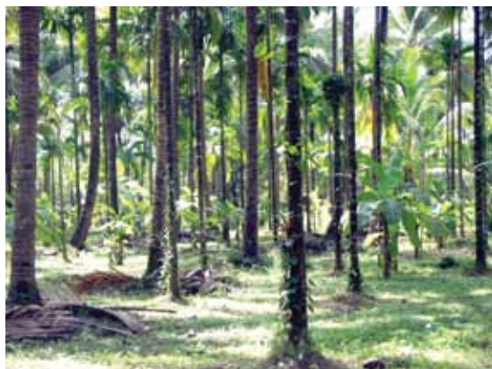
Coconut based cropping systems