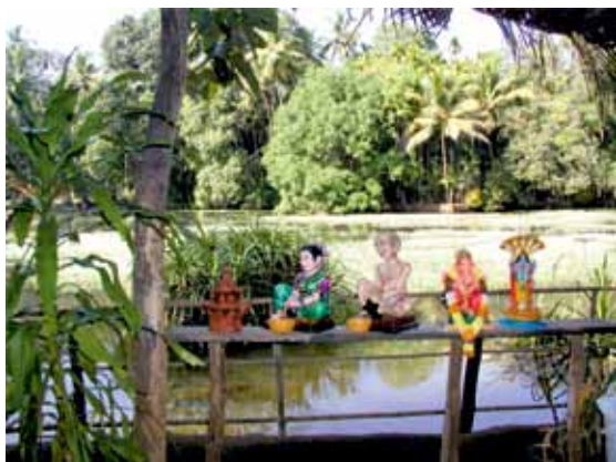
Making agro-tourism attracting with artisans