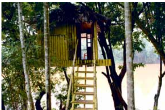
Tree hut at agro-eco-tourism unit