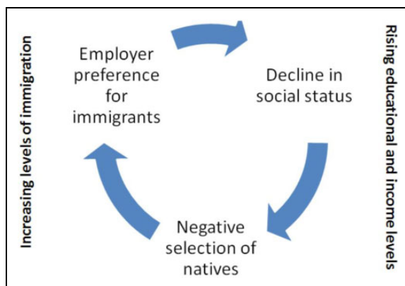
Figure 2. The Cumulative Causation of Immigrant Niche Formation.

decline in social status, and negative selection of native-born workers — are mutually self-reinforcing. This suggests that once an immigrant employment niche is established, it will last well into the future.