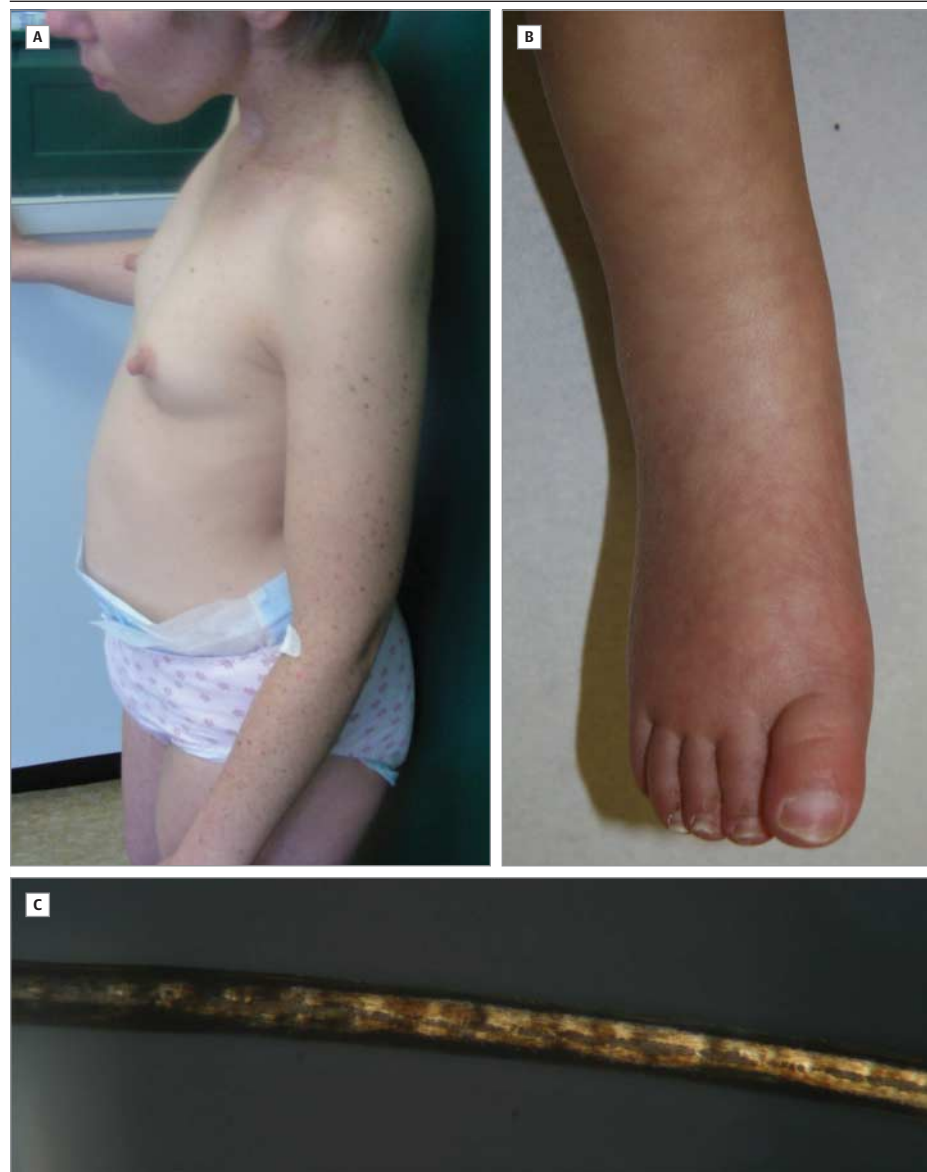
Figure. Dermatologic and Hair Findings of 3 Patients With Cockayne Syndrome

A, A 28-year-old woman with pigmented macules on sun-exposed area (left arm). B, Cyanotic edema of the right leg in a 3-year-old child. C, Pseudo "tiger-tail" appearance of 1 hair shaft (polarized microscopic examination; original magnification \times 400 ).