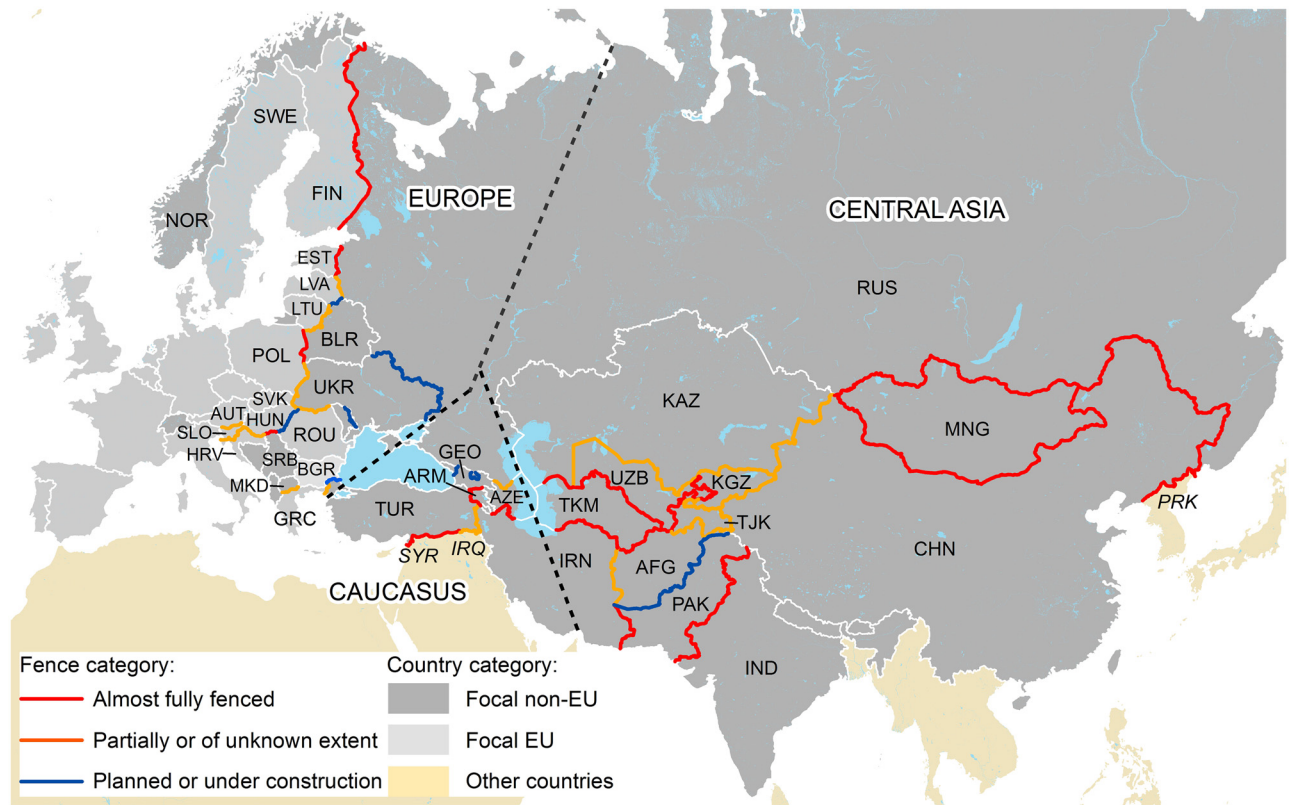
Fig 3. Extent of border security fencing along national borders in Europe and Central Asia.