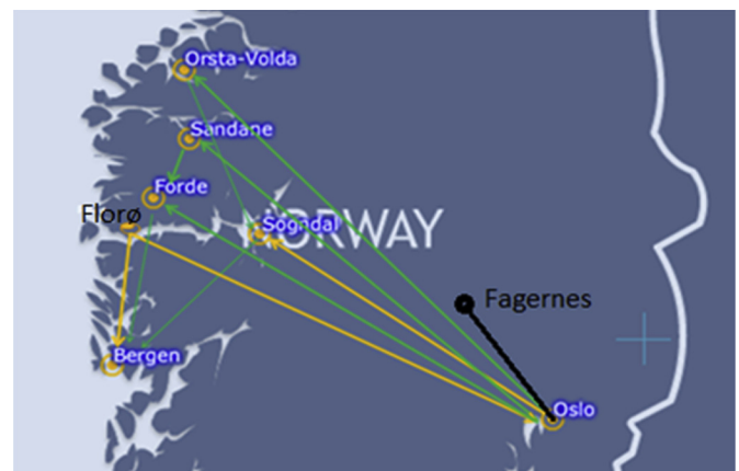
Fig. 4. The North West route area.

However, Table 6 shows that with fixed airfares and divisible