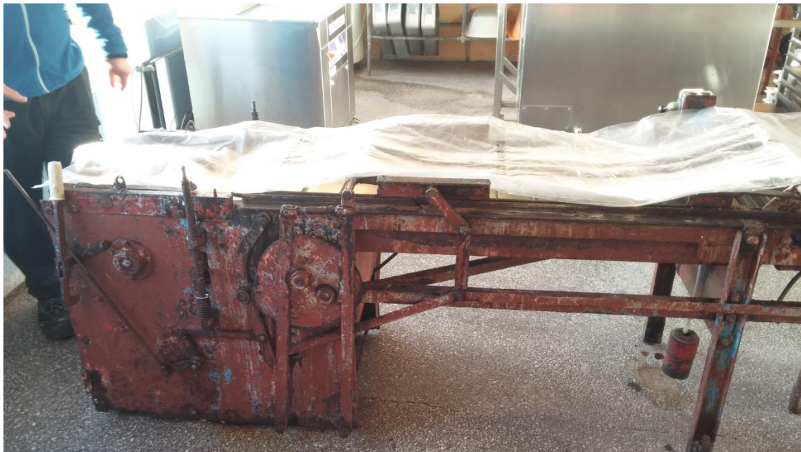
Vintage equipment for making fish cake owned by Horsgaard.

Every evening at eight and next morning at five, the store receives fish by cars or trucks from Bud and Aukra, near Molde. Each fisherman has processing facilities in the vessel, so Horsgaard only needs to do a few simple processes, except for some seafood which is not local like king crab, shrimps and green sole etc.