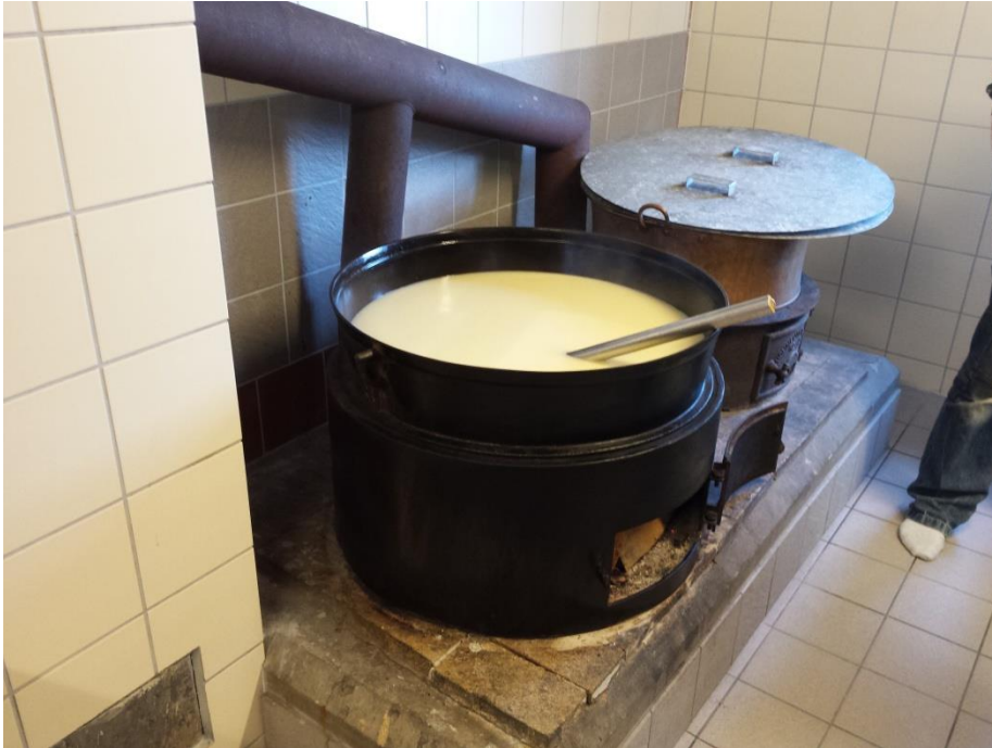
Traditional brown cheese production, using a cast iron pot to evaporate the milk.

agricultural curriculum. But they prefer to hire permanent workers because of the need for stability.