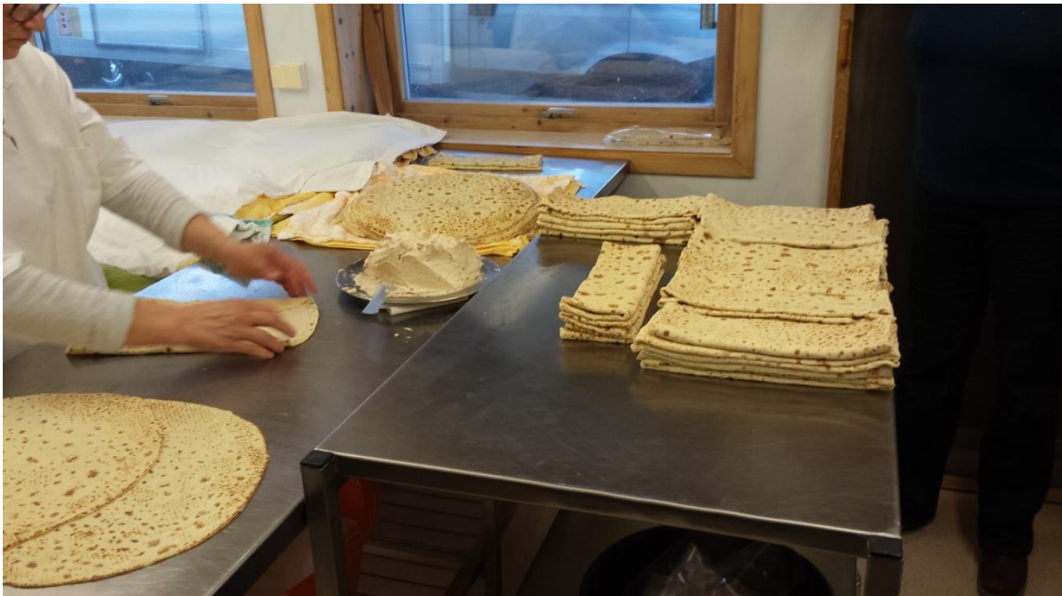
Handmade lefse production with traditional recipes

Lefse is made with potatoes, flour, butter, and milk or cream. It is baked on a griddle. It generally resembles a pancake or flatbread and has butter, sugar and cream inside. Heimebakst bakery produces 6 different types of lefse which include Solemdalslefser, Buggelefse, Snipp and Tykklefse. Some of them are named according to the origin of the recipe. Potatolefse is a new type this year.