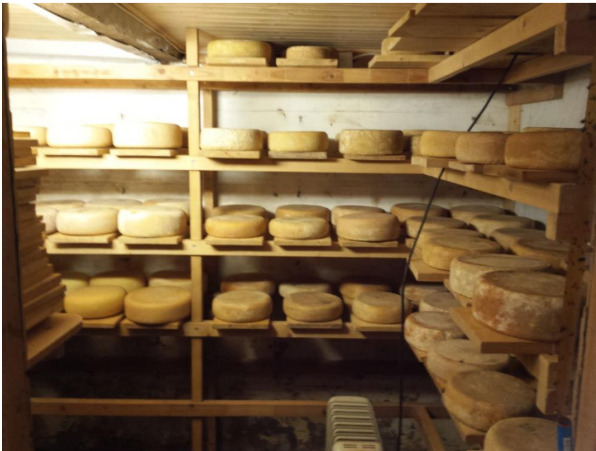
Fermentation of the traditional Norwegian brown cheese

Brubekken is not the supplier of Coop Mega in Molde. The marketing of Brubekken is to sell to supermarket, hotel, farm shop, and farmers' market. It is very complex. In total, they try to sell their products in as many ways as possible. The farmers' market in Trondheim is one of the biggest in Norway which opens 2 times a month. The distant place is Oslo using