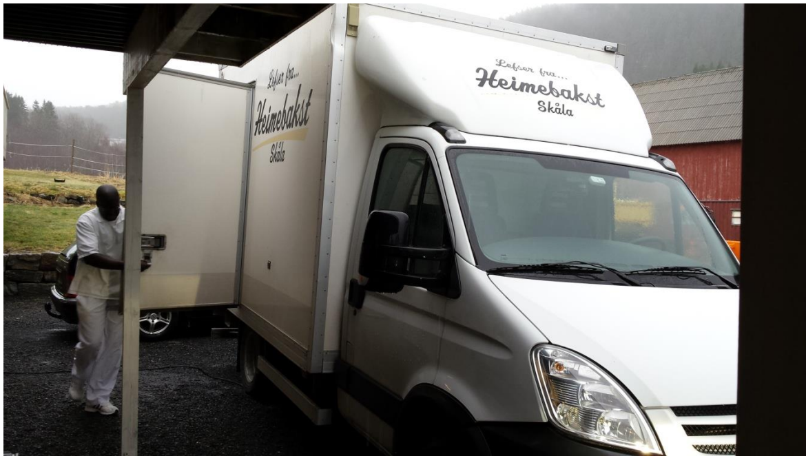
Heimebakst's own transportation van

Heimebakst delivers products by their own truck. The truck has freezer inside. They drive to Coop Molde once a week and twice a week to Trondheim.