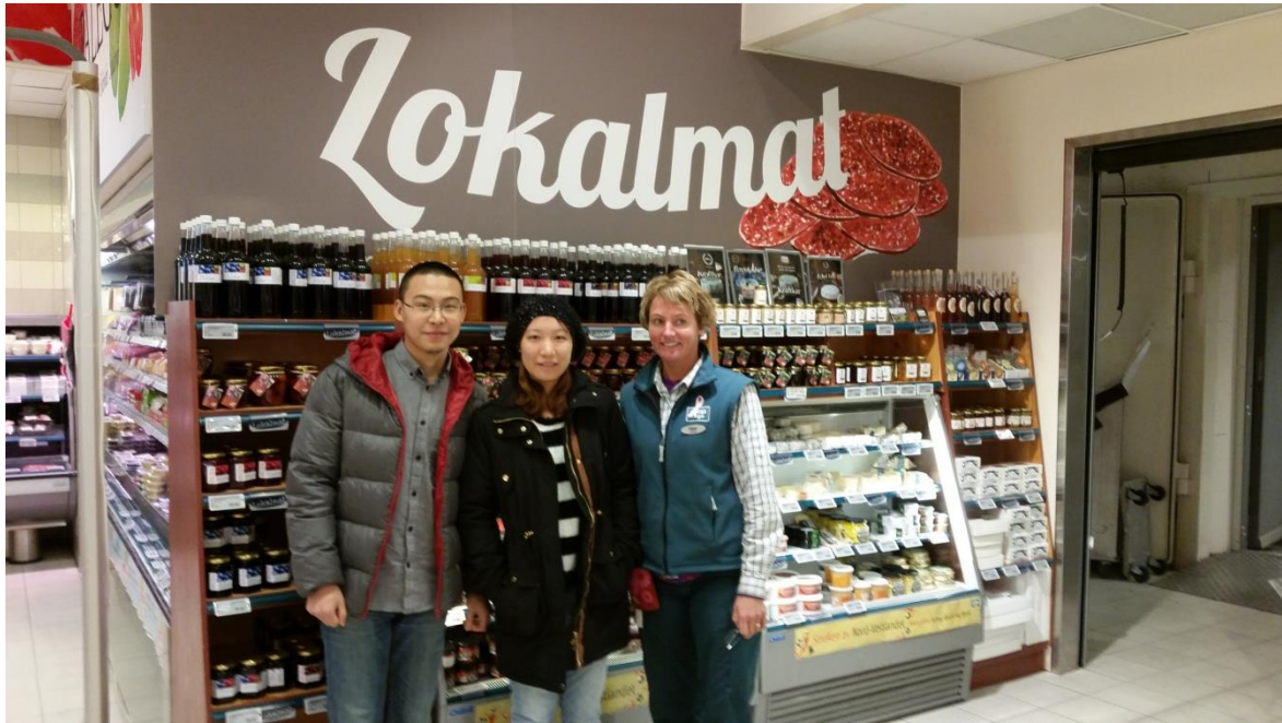
The local food section in Coop Mega Molde. The authors with our informant at Coop Mega Molde.

There are two distribution ways from farmers to Coop. Lots of local farmers choose to deliver products by themselves. They come to Coop to ask if they need the foods they have produced. The delivery costs are paid by themselves. Another way is through Coop distribution centre. Farmers transport their products to the Coop centre. Then trucks from Coop deliver products to the shop about once a week. Coop has three ways to purchase local food. One is through PDA(Personal digital assistant) which is a mobile electronic device that functions as a personal information manager. Another is that Coop telephone them to order it. The most common way is that farmers contact the shop directly by phone. Their marketing is personal. The quantity of goods ordered are such that local farmers can have a predictable profit. Because of Coop, these small local suppliers can survive so they are very dependent on Coop.