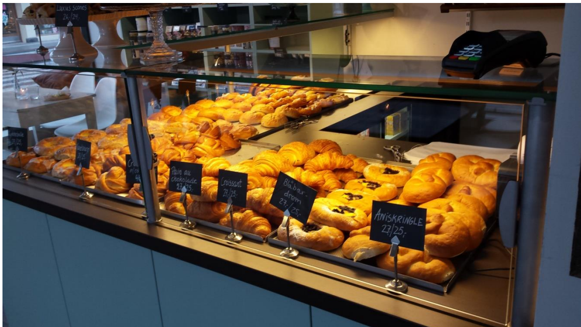
Handmade bread in Fole Godt store in Molde downtown

The main products of Fole Godt are bread. Besides bakery products, she also sells coffee, chocolates and olive. Handmade craft means doing almost everything by hand except dough mixing, in contrast to industry bakery. What's more, Fole Godt does not use any artificial ingredients. They prefer to use ordinary whole milk and eggs rather than milk or egg powder. The bread they make is fresh and healthy which can only store for 2-3 days.