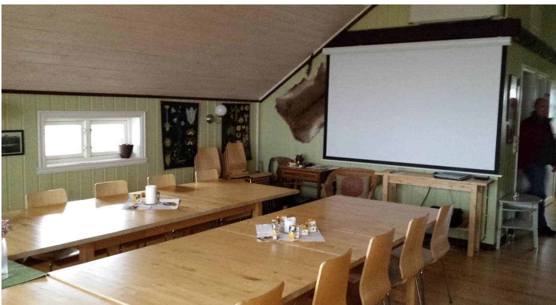
Dining and meeting area at the farm