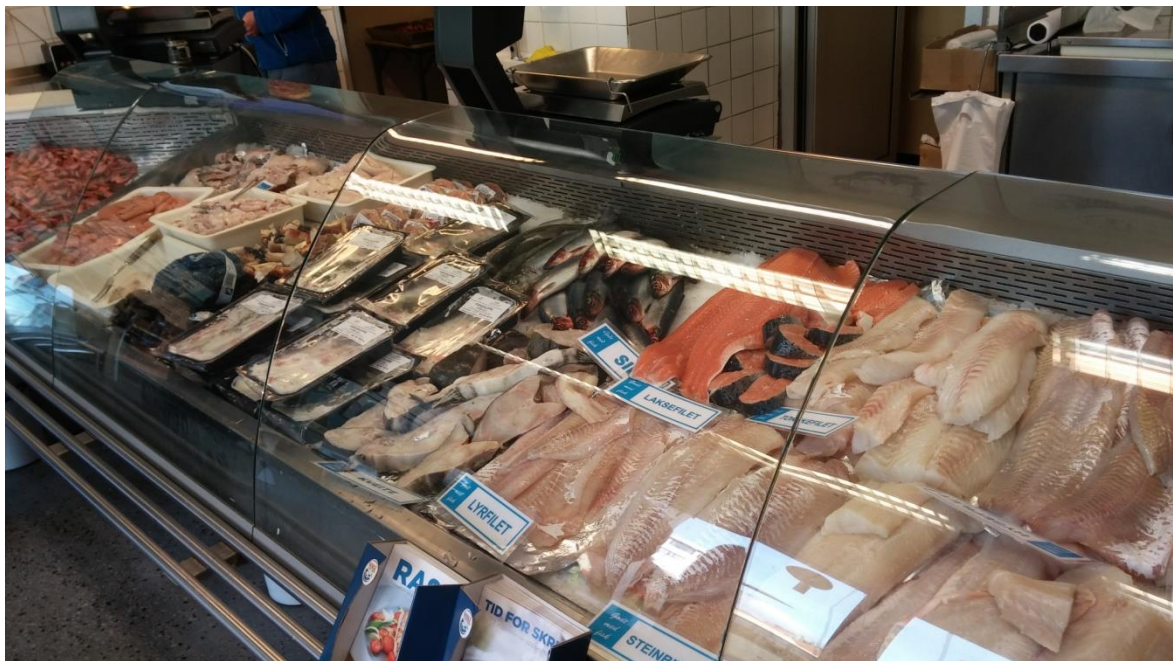
Local sea food in Horsgaard store in Molde downtown

Horsgaard is a local fish store located in Molde city centre. It is the fish supplier of Coop Mega. All the fresh fish of Coop is ordered from this company. In addition, Horsgaard also plays the role of fish trader. It not only sells fish in its own store, but also sells to hotels, restaurants, schools etc. Sometimes, it even delivers fish abroad.