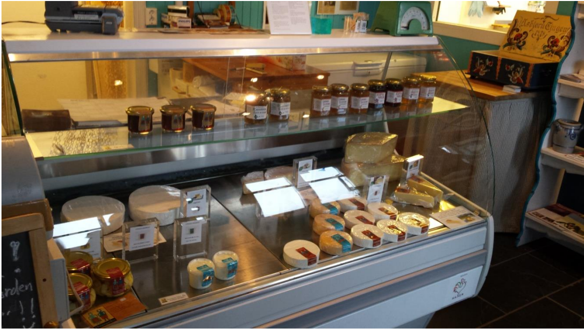
Local dairy products in Derinngarden farm shop

from other farmers. Local famers help each other to sell and transport products.