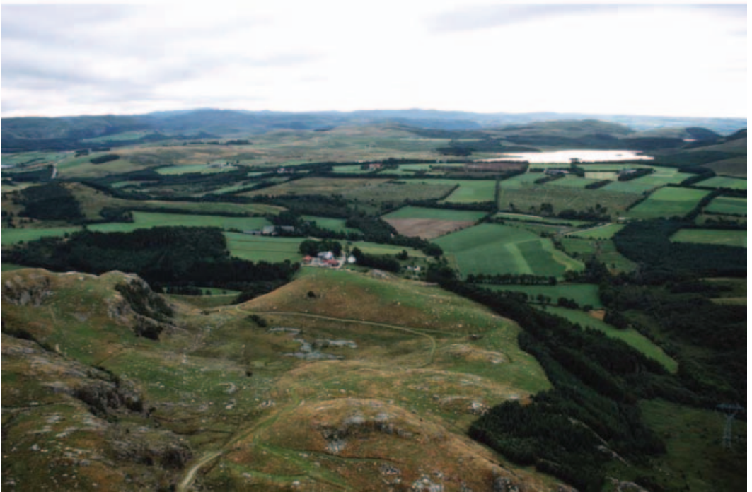
Fig. 2. The agrarian landscape in Jæren is uniform and mainly treeless farmland of low-lying, undulating lowland with a restricted area of upland. The natural environment is scarce with remnants of forests, wetland and unfertilized pastures.