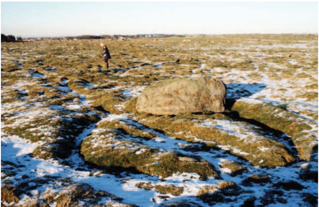
Fig. 3. Earthwork of ‘fairy-ring’, the relic of a ditched haystack base. Original distribution was alongside wet heaths and mires in the outfield and wetland environments (Lillehammer 2005:103, Fig. 3b).

The interdisciplinary result from the case study of ‘fairy-rings’ in Hå municipality, South Jæren, indicates the earthworks to occur in the pastures together with clearance cairns in the Iron Age (Fig. 3). The excavations of the ‘fairy-rings’ yielded dates at the earliest to the end of Migration Age (cal. AD 410–450) and at locations together with clearance cairns to late Iron Age (cal. AD 670–900) (Prøsch-Danielsen 2001:54, table 4). The original wetland environment (Prøsch-Danielsen 2001) indicates the integration of marginal land in the harvest practice of mowing, collecting and storing hay in the open air during the winter months. The land use of outfield and wetland resources relates to the infield-outfield system in the prehistoric farm structure of the Iron Age (Myhre 1974:74, Fig. 1, Myhre 2004:50–51, Fig. 51). Established in the form of a continuous stone string in the Roman Age (after AD 200) (Myhre 2004:52), this clear division between infield and outfield in the construction of a cattle fence was to form a basis for the development of medieval and post-medieval farm structures in Jæren (Myhre 1974:73, 78, 2004:Fig. 62, Lillehammer, A. 1979:35). The fixed relationship between infield and outfield corresponds with the agrarian development of farm structure elsewhere in the western part of Norway (Julshamm et al. 2002).