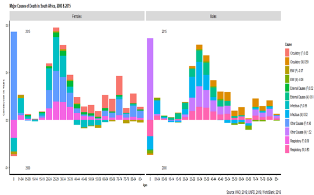
Figure 3: decomposition of the contribution of the major classes of causes of death to life expectancy for males (M) and females (F) in South Africa, 2000 and 2015

To correctly understand the contributions to life expectancy over time, the study selected the initial and final years from the data to decompose the age- and cause-specific contribution to life expectancy. The results are presented in figure 3 which shows the contribution to life expectancy among females and males over time. Generally, males within the ages 25 to 49 years recorded the highest contribution to life expectancy from the causes of death. For females, 20 to 39 years recorded the highest life expectancy gains for the periods under study. However, in 2000, external causes contributed lower to the life expectancy among males at ages 15 and 54 years. In 2000, infectious diseases retarded the life expectancy of females within the ages of 20 to 34 years. By 2015, the reduction in life expectancy made by endocrine diseases were significantly higher among females (-0.07) than males (-0.06). The contribution made by the respiratory disease to life expectancy was considerably higher among females (0.88) than males (0.59).