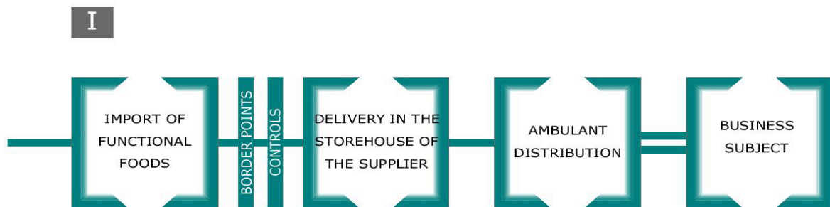
Figure 1: The imported supplies in Kosovo's internal market.

Functional food such as dairies come into Kosovo's internal market as imported from different places of European Union, these places are obliged to fulfill some criteria regarding the quality in accordance with the law for safe food in Kosovo. The imported supplies of internal market, has written ruled that should be fulfilled by every distributor, supplier or business that wants to operate with foods. The supplying of functional food in the internal market is realized as follows: starting from the border lines- The delivery of the foods inside Kosovo's territory, then in the distributors' storehouses, the delivery in accordance with the businesses, the delivery for the businesses (supermarkets), the delivery into the businesses' storehouses, and lastly positioning for the sales' shelves.