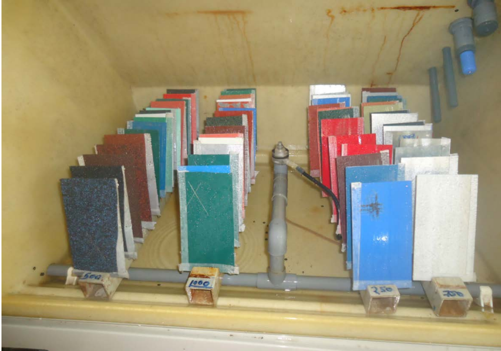
Figure 3: Arrangement of samples during salt spray (Fog) process

The samples were placed under ultraviolet light (Figure 3) followed by salt spray at concentrations of 0.07% NaCl and 0.28% (\text{NH}_4)_2\text{SO}_4 . Color changes were observed within a complete cycle of 10.5 days after which the samples were cleaned with detergent, washed with acetone and dried. Spectroguide (BYK Gardner 82638, GMBH) was then used to measure gloss loss ( \Delta G ) in % and fade ( \Delta E ) in Hunter units for the pre-painted roofing materials.