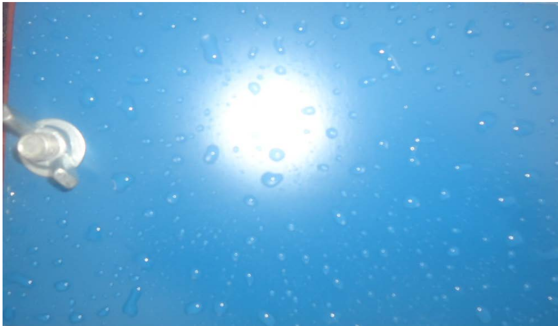
Figure 2: A Sky Blue pre-painted roofing sheet panel showing rain droplets during the time of wetness. The time of wetness is an important parameter since it directly determines the duration of electrochemical corrosion process.

The presence of moisture on the surface of the metal is known to initiate corrosion by acting as an electrolyte [6]. A typical example of droplets of moisture on the surface of a roofing panel is shown in Figure 2.