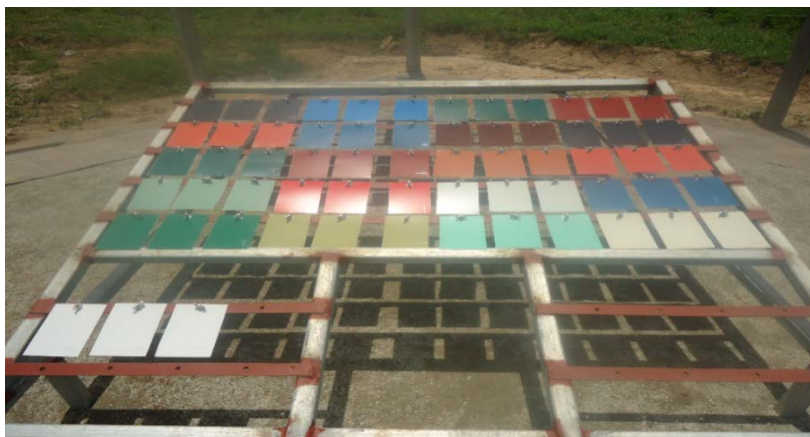
Figure 4: The pre-painted samples fastened on an exposure rack at Mariakani corrosion test site.

The samples for the outdoor exposure test were taken from a similar batch measuring 190mm \times 130mm in size and were cut using a shear cutting machine. The samples having a thickness of 0.20mm to 0.50mm were placed on the exposure rack as shown in Figure 4.