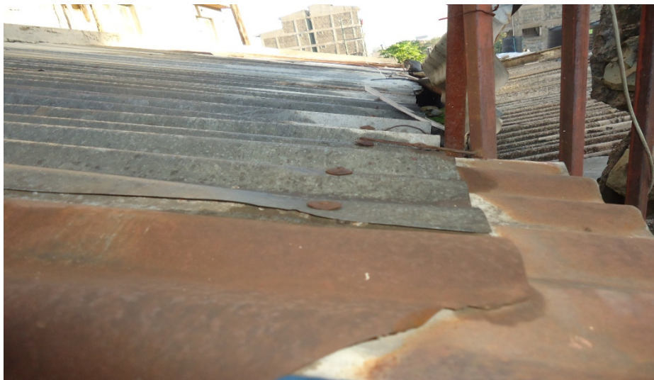
Figure 1: Corroded galvanized roofing sheets close to the Mariakani-Mombasa highway. The iron nails have turned reddish.

In Mariakani area in the coastal region of Kenya, roofing systems in most houses use galvanized (GI), galvaluminized (AZ) and pre-painted steel sheets. Hence in this study the rate of corrosion of the roofing materials was investigated based on the color change without considering the type of paint or the components. The roofing materials in Mariakani are frequently painted to prevent corrosion. A typical corroded roof in Mariakani is shown in Figure 1.