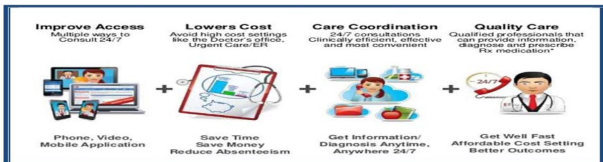
Figure 2: level access to patient has (correct information) [3]