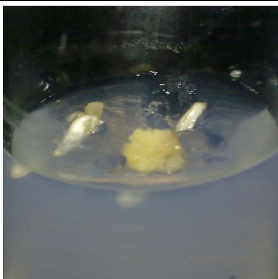
Figure 4: Callus induction of BRRi dhan47 on MS media containing 3 mg/l 2,4-D

Other researcher [8] found better callusing frequency at a concentration of 2.5 mg/l 2, 4-D. The two varieties BRRi dhan47 and BRRi dhan53 showed higher callus induction frequency on 3mg/l 2,4-D that is 85 % and 70.59 %, respectively. These results are confirmatory to the findings of other researchers [4, 14]. The response of the explants to different concentrations of 2,4-D in terms of callus induction was genotype dependent. These findings are in agreement with previous reports of other researcher [8]. The present study revealed that both genotype and media composition and their interaction largely effect on callus induction.