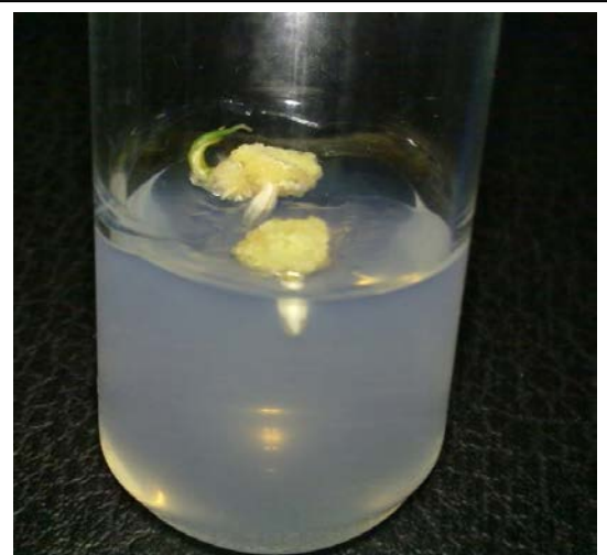
Figure 5: Callus induction of BRRi dhan53 on MS media containing 3 mg/l 2,4-D