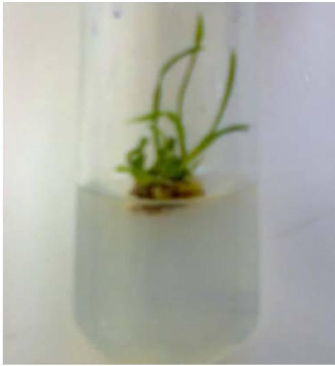
Figure 6: Shoot regeneration of BRRi dhan47 on MS+ 2 mg/l kinetin, 2 mg/l BAP and 1 mg/l NAA