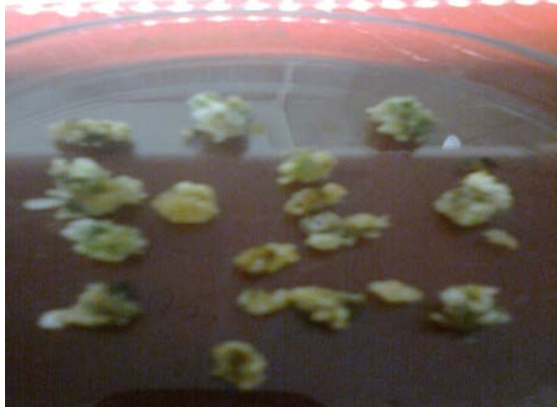
Figure 2: Callus of BRRi dhan47

Mostly 2,4-D has been used as the only growth regulator in callus induction media . The results from our study revealed that both varieties gave better callus induction response on MS media supplemented with concentrations of 2, 4- D 3.0 mg/l (Figure 2, 3, 4, 5).