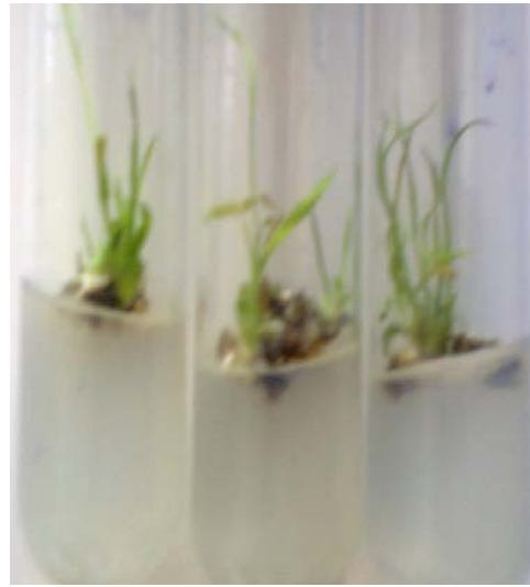
Figure 7: Shoot regeneration of BRRi dhan53 on MS+ 2 mg/l kinetin, 1 mg/l BAP and 1 mg/l NAA