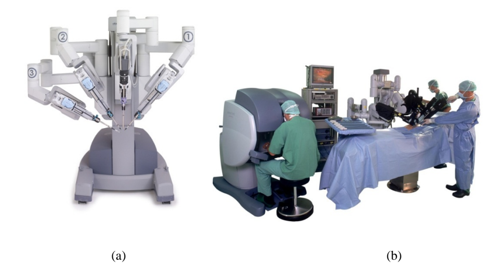
Figure 2: (a) Da Vinci surgical system (Courtesy of Intuitive Surgical, Inc.). From left to right: surgeon console, vision system, and patient-side cart; (b) detail of the patient car [2].

instruments that are remotely controlled. Figure 2a presents the economic opportunities where robots provided services to Da Vinci MIS [2]. It mainly contains three segments which are: a mechanism which provides the input (surgeon's console), interfacing (vision system) which are done digitally, and a mechanism (manipulator, patient-side cart) which provides the output. Presently, the primary system doesn't fuse touch as well as the capacity of haptic sensing but various task has been drifted towards that path for both training and surgical purposes (e.g. suture training) [58].Tactile sensor can be also used for gait analysis. Sensors which are established by Tekscan Inc. which provides the balancing in the functions of a foot. While gait if an imbalance is observed in the foot, a torque which is repellent and force segments which creates friction on tissues present on our which causes a sort of uncomfortable sensation .Touch sensing are proposed in dental implants. Tactile Technologies, Inc., ILS comprises of copyright technology that allows attaining the images of maxillary bone contour which are mechanical without clearing out any tissues of the gum. The injection is calculated by using miniature position encoders and a DSP electronic [59].