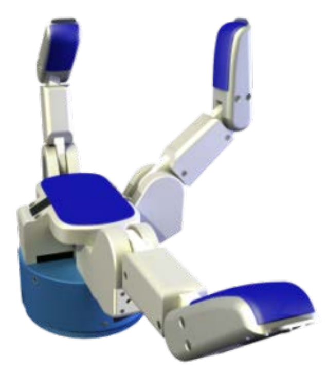
Figure 3: Barrett hand [61].

Figure 5 shows the SynTouch Biotactile Sensor. This sensor uses a thermistor, a set of impedance sensing electrodes and a hydrophone to implement temperature, force and vibration sensing respectively. BioTac sensors can execute a task much better as compared to human.