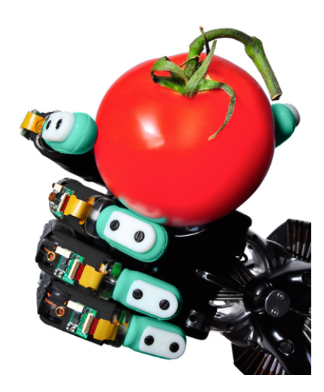
Figure 5: SynTouch BioTac tactile sensor [2].