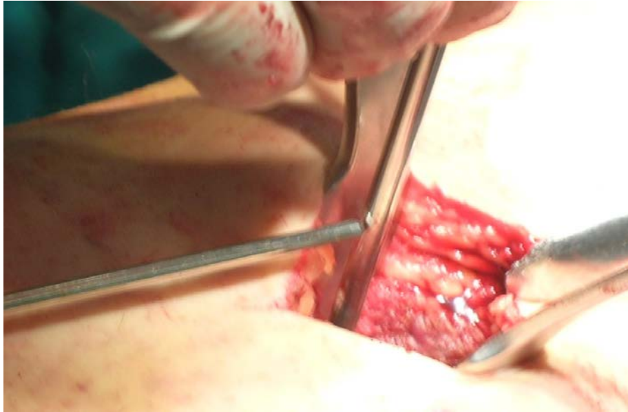
Figure 6: exposure of the distal part of the humerus and taking a mechanical mark over the bone

A mark over the supposed site of the nail distal locking hole is taken on the bone by the diathermy or by a straight awel midway between the medial and lateral borders of the humerus. See Figure 6.