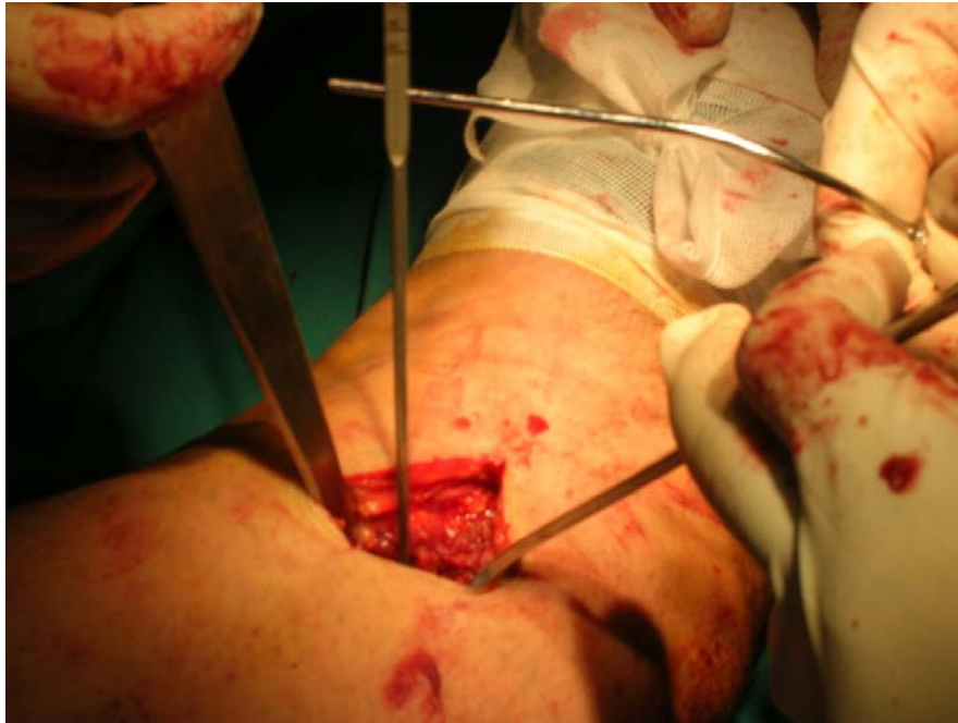
Figure 9: introduction of the depth gauge inside the drilled hole in the anterior cortex of the humerus and its motion when it is hit by the tip of the optical fiber which is moved forward and backward inside the nail (the mechanical check)