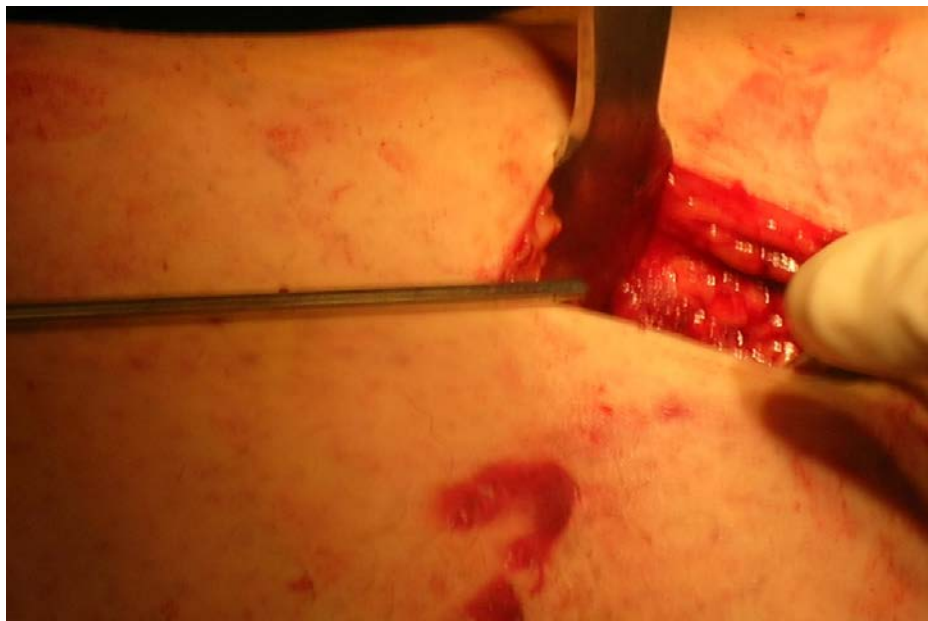
Figure 5: incision of skin over the distal part of the arm according to the mechanical mark