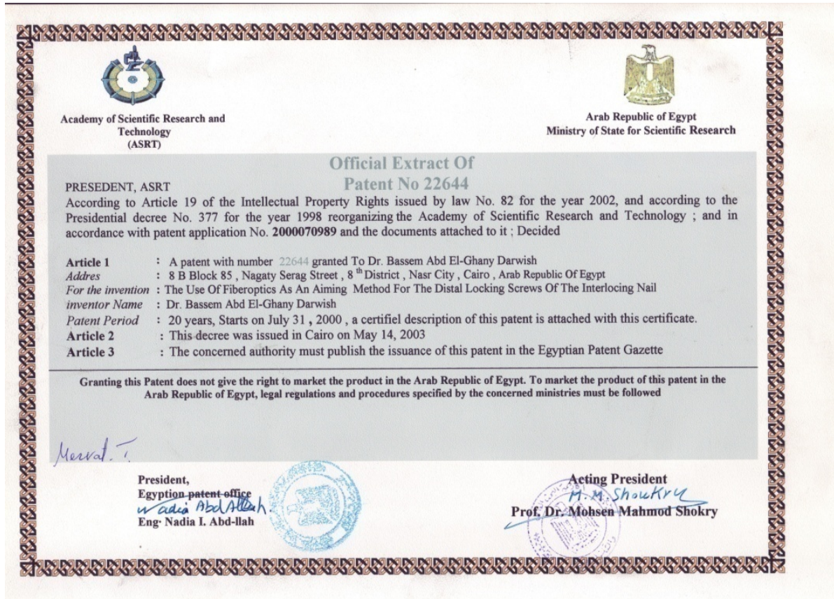
Figure 4: Official extract of patent number 22644, Egytian patent office.

A longitudinal single incision is done using the mechanical measure then the soft tissue is dissected until the bone is reached and the periostium is incised and 2 bone levers are applied. . See Figure 5.