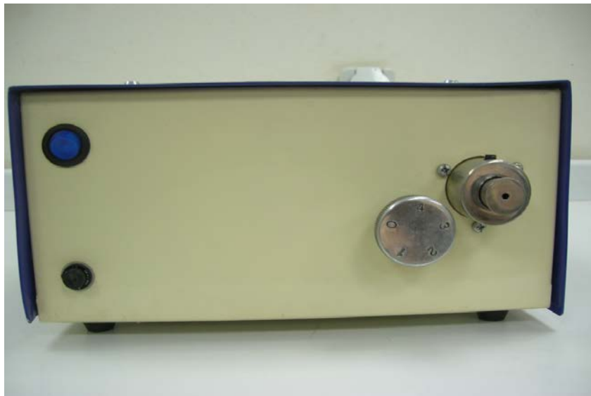
Figure 1: front view of the light source

It is a xenon light source, 150 watt, with an ordinary electric circuit, and light concentration system composed of 3 convex lenses. The light source could be used for other purposes like arthroscopy and microscopy but the light sources of these systems could not be used for our technique because the optical fiber cable we use could not withstand temperature more than 80 °c. The expected life span of the light source is about 7000 working hours. see Figure 1& 2.