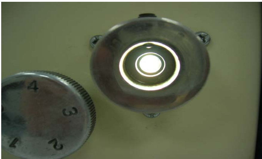
Figure 2: light exit and intensity control unit of the light source