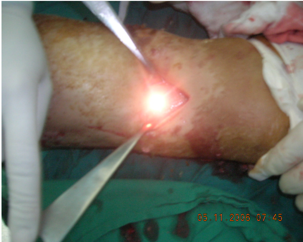
Figure 8: the site of the distal locking hole of the interlocking intramedullary humeral nail after drilling the anterior cortex and suction of the blood (the physical check)

The drill bit is adjusted to the center of this ellipse and the drill is perpendicular to the introduction handle of the nail in both coronal and sagittal planes then the drilling is started. Before the surgeon feels that the bone is going to be pierced the optical fiber is withdrawn for 0.5 cm to avoid destruction of its tip by the drill bit. After piercing of the nearby cortex a 3.5 mm suction handle is introduced in the bone hole to suck the blood after which the whitish xenon light appears evidently through the bone hole (physical check). See Figure 8.