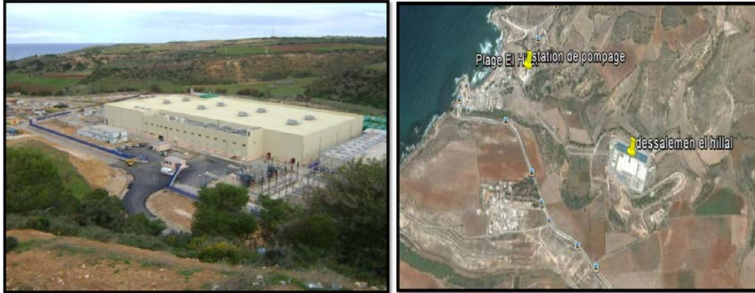
Figure 2: Chatt El Hillal station: a (general view), b

for the physicochemical of water, and this, before and after the treatment of water, as well as rejections of this station. Three samples are taken during the year 2013. The same experimental protocol of the sampling of rough sea water according to Rodier (2010) is used for each stage [4]. The parameters to be analyzed are selected according to the required objective. The temperature, conductivity, salinity (TDS) and the pH are measured in situ . The water samples are analyzed at the laboratory to evaluate the average contents of magnesium ( Mg^{++} ), Phosphates, Bicarbonates CaCO_3 , Chlorides, sulfates ( SO_4^- ), Nitrates ( NO_3^- ) and Nitrites ( NO_2^- ).