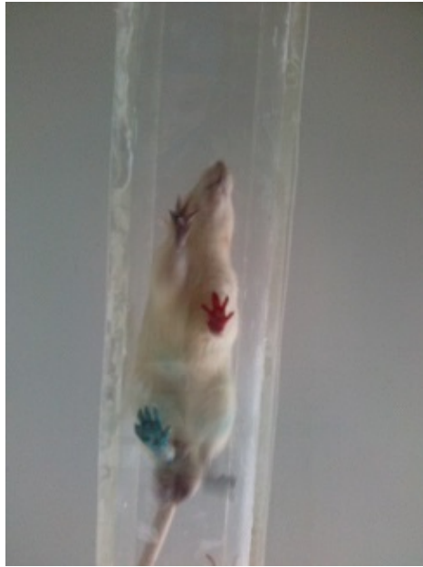
Figure 6: A rat walking in SFI alley. The paw were painted using four ink colors