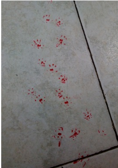
Figure 3: The measurement result of rat's footprints without using SFI alley and with one ink color