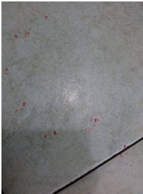
Figure 4: Rat's footprints without direction

Theoretically, in rats' torso movement, especially in sagittal plane, there are two main typical movement according to its distance to sagittal plane, i. e. abduction and adduction. The important muscles in abduction of hind limb are superficial gluteal and biceps femoris muscle. Superficial gluteal muscle originates in the os ilium and inserts in femur. The biceps femoris muscle has an origo in vertebrae and insertion in the tip of distal femur and proximal tibia. When both muscles abduct the hind limb, not only the two muscles are needed as the prime