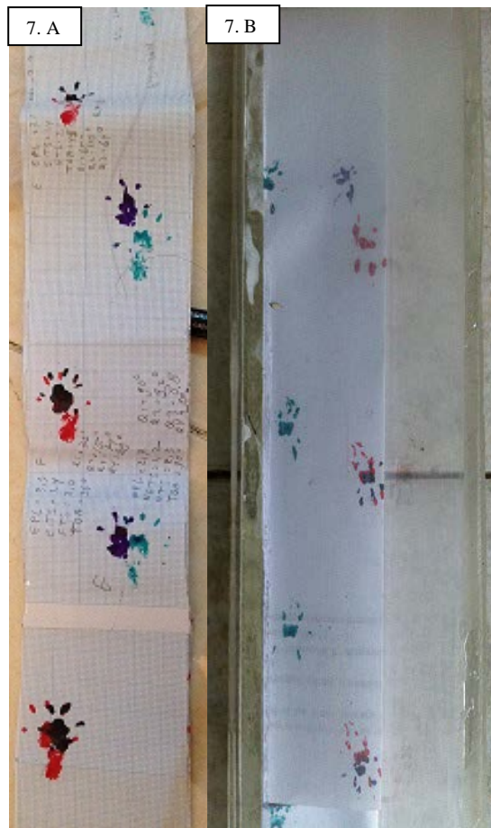
Figure 7A: A paper showing rat's footprint in four colors without alley; Figure 7B: A paper showing rat's footprint in four colors with alley