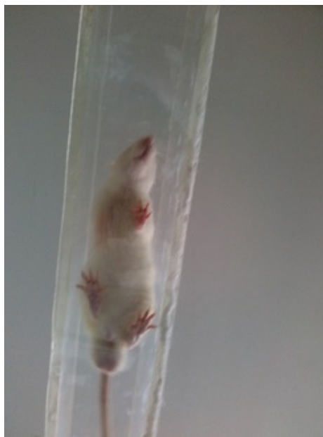
Figure 5: A rat walking in SFI alley

This study uses SFI alley to ensure that the rats walk straight as seen in Figure 3. Figure 3 shows the unmarked rats' paw. Although rats have been ascertained to walk straight to determine the sciatic nerve function index, the analysis was still difficult. First, the rats walked very fast, causing in-optimal data recording and collecting. Ink markers with different colors were needed for each foot and the floor had to be covered with graph paper. The objective of the use of different four was to ensure that the rats' footprints could be easily analyzed and studied in detail as seen in Figure 7A and 7B, which showed the paper with rats' footprints.