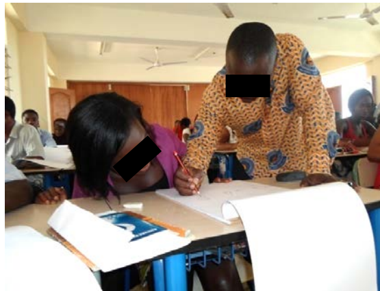
Fig. 2: A lecturer assisting a student in a drawing class

In this case, one may ask whether it is wrong be involved in demonstrating drawing activities to students. This can be made clear if the words “guidance, support, supervision and assistance” are carefully considered in the way drawing activities should be demonstrated to students to learn. One can further ask; should “guidance, support, supervision and assistance” be taken to mean that a Lecturer/Instructor practically be involved in producing a student’s work or be required to offer advice and direction to the student? Since drawing is more subjective than being objective, the findings in this study revealed that it is important to allow students to explore their minds and creative abilities in drawing. This is because the mistakes they commit may either become or lead them into learning new techniques, methods or procedures of drawing.