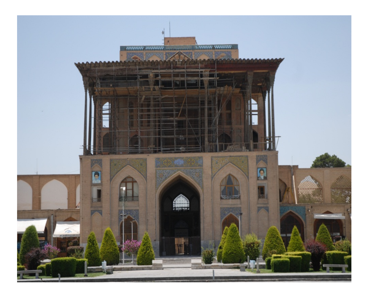
Figure 2. Ali-Ghapoo Palace from outside view; the restoration of the monument is seen in this figure.

Beauty and importance of Ali-GhapooPalce and Naghsh-e-Jahan square draw attention of United Nations Educational, Scientific and Cultural Organization, UNESCO, to place this square in word heritage list No 115 [19]. According to the documents of UNESCO, the Ali-Ghapoo Palace forms a monumental entrance to a luxurious zone and to royal gardens which extend right behind it. The apartments of Ali-Ghapoo with wide exterior openings which are fully decorated with paintings are famous. Briefly, the royal square of Safavid dynasty, Maidan-e-Shah of Isfahan is the monument of the Persian socio-cultural life during Safavid period until 1722. Thus, the cultural property proposed by Naghsh-e-Jahan square and Ali-Ghapoo Palace motivate UNESCO to include it in the world heritage list which shows importance of these architectures. In addition, Hensel and Gharleghi claimed that Naqsh-e Jahan square is the largest historical square worldwide and the sixth largest square overall [20].