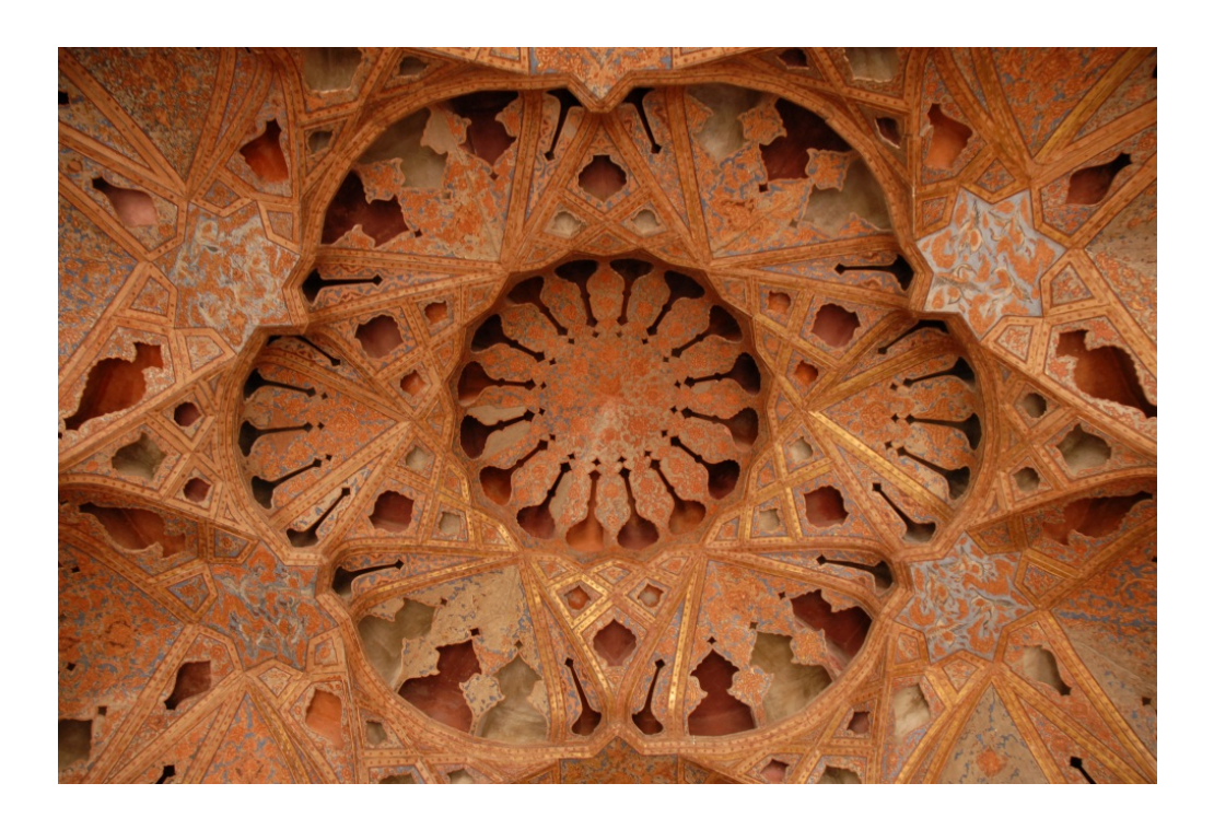
Figure 3. Ceiling of the musician room located at inside of Ali-Ghapoo Palace.