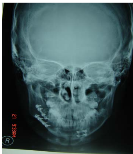
Fig. (1) PA.view ,bilateral fractures of mandible treated by mini plate 2.0mm/screw system ,group 1.