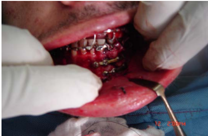
Fig. (3) Intra operative surgery, fracture symphysis of mandible treated by mini plate 2.0mm/screw system with IMF for one week,