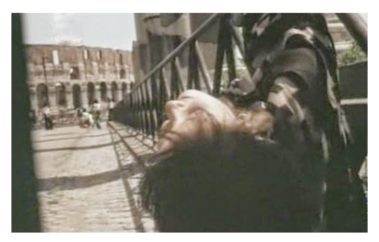
Figure 3 : Claro's rotations (Glauber Rocha, 1975)

In the wake of Amilcar Cabral's theory of culture (Cabral, 2011), according to FRE-LIMO, the cultural and aesthetic forms of the young nation should synthesise the formal elements of the ideal of modernity and modernization of Samora Machel and the traditional modes of cultural expression (Guebuza & Vieira, 1971; Machel, 1974, 1978). Inscribed in the Marxist conception of modernity, FRELIMO's cultural project is based on the careful selection of a set of traditional cultural forms and the consequent exclusion of others, essentially of ritual acts and practices, such as initiation ceremonies. By expressively documenting the de-structuring and structuring of the Makonde rituals after independence, Mueda, Memória e Massacre conciliates the country's changing traditional and modern culture. In this manner it achieves the desired cultural synthesis, situating Mozambican culture between ritual and modernity, without, however, adopting the system of inclusions and exclusions set up by FRELIMO,