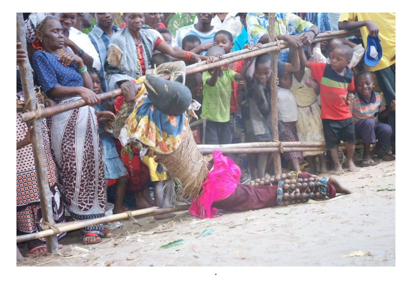
Figure 6: Nshindo, Litamanda village (Macomia). Ng'avang'a (dog)

In line with Third Cinema and in proximity to the prevailing theoretical framework of the INC's first years of operation, Mueda, Memória e Massacre offers a singular vision of political cinema. The issue at stake wasn't to transform the viewer or lead him to a new state of consciousness, the finality of the militant forms of the pre-cinema of the War of Liberation. Nor does the film contribute to the constitution of the people as the natural historical subject of Mozambican revolutionary cinema. On the contrary, the rotational movement of the gaze — from the observed to the observer and from the latter to itself as the enunciative instance — suspending the mechanism of identification of the spectator with the character and with the cinematic device, establishes a complex dialectic between the film to come and the projected film. Attempts are made to produce a radical and complete rotation. This is not just a question of inverting the representational axes, but also of redefining the values of position, destituting the dominant perspective through the emergence of an active and critical spectator, a potential producer. This process has important political and epistemological consequences, in particular with regard to the politics of history and memory and deconstructs the fiction of the resisting and homogeneous people, which paradoxically strips it of its political autonomy.