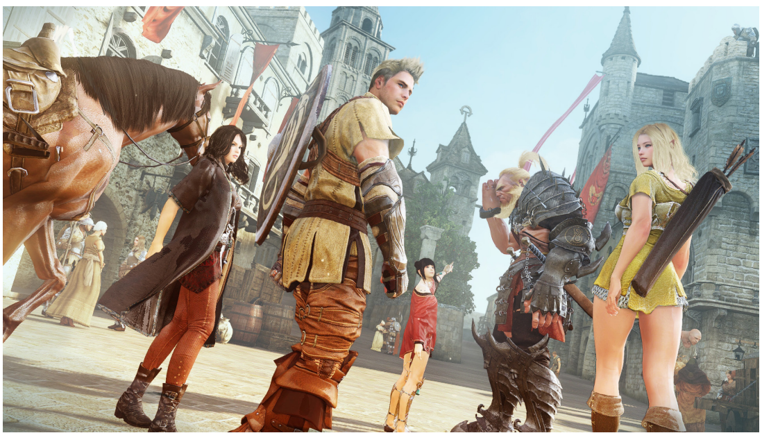
Figure 2. Black Desert is a massively multiplayer online game where players control excessively goodlooking avatars inside a fantasy world. This is representative of many other online games. (Black Desert promotional image @Copyright 2014 by Pearl Abyss, http://black-desert.com/media/)

Thus in online worlds, players will usually have the option to create idealized avatars, where characters are athletic, stylish, physically appealing and possessing in-human characteristics (see Figure 2).