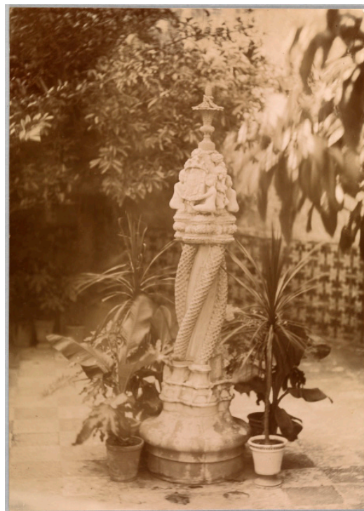
Figure 8: Sintra, Palácio da Vila, Column Torsa in the Courtyard of the Nozzle (or Central plaza). Maria Pia, 1892. Gelatin and Silver Print on paper, 18,1x12,9 cm. Inv. PNA. 61764

The photographs of Maria Pia which are accessible to the public, do not follow under the category of family and domestic photography, even if there are a few documenting the leisure activities of the group surrounding the queen. Maria Pia clearly privileged the landscape genre, representing both the fields and the seafronts. The representation of the sea was a famous genre known as “marines”, which was very appreciated in the painting of the time. The attention she gave to the monuments, to room interiors, and decorative details characteristic of the architecture, reveal her well educated look and taste (Figure 8). This taste is also evident with regard to the documentation of the people of the region. These representations were very much in tune with the taste of the painters of the time. These search for human “types”, turning peoples into the “others,” and into the “regional types”, emerge in accordance to the works of ethnography and anthropology, as well as the historiography of the time. These sciences were concerned with characterizing the natural landscapes and the cultural regions and countries, contributing to the affirmation of a nationalism trend that was, of course, dear to the monarchy.