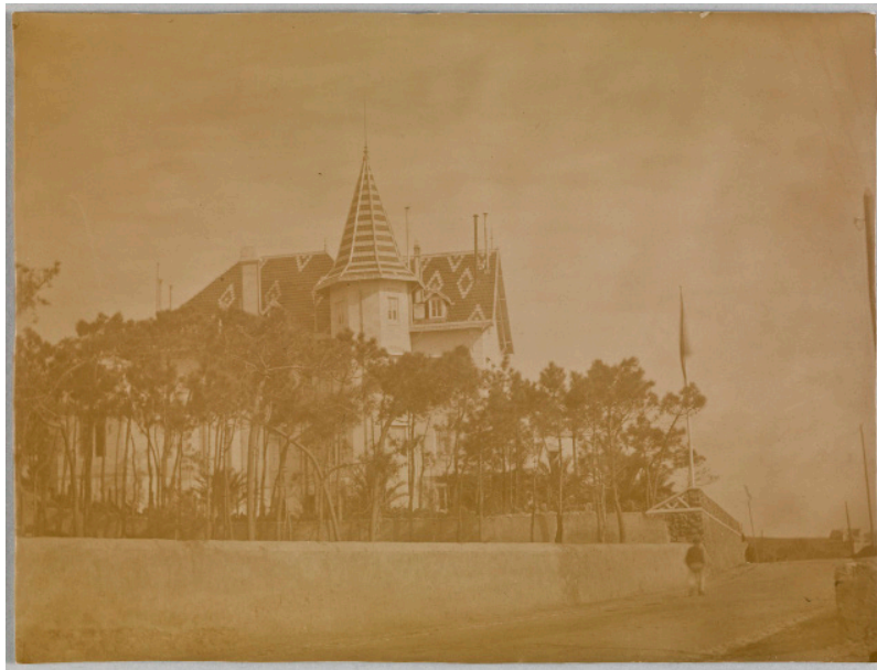
Figure 4: The Royal Palace of Estoril, Maria Pia, 1894. Gelatin and Silver Print on paper, 15,8x21 cm. Inv. PNA. 62263