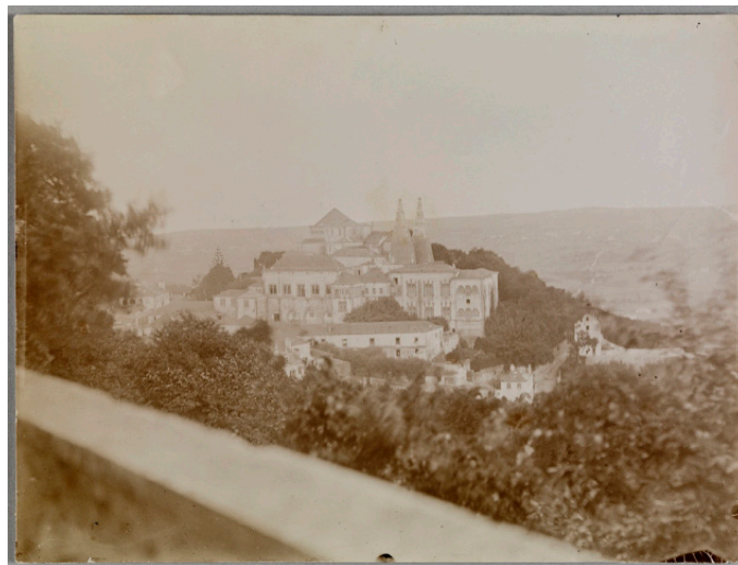
Figure 1: Sintra, Palácio da Vila, Maria Pia, 1892. Gelatin and Silver Print on paper, 20,9x15,7 cm. Inv. PNA 62334

Maria Pia is one of the few authors mentioned in the History of the Photographic Image in Portugal (op. cit.), and this happens due to her participation in the I National Exhibition of Amateur Photographers , in 1899, already referred to. On this date it is likely that she already devoted herself to photography at least for a decade. According to Maria do Rosário Jardim, the first signed prints that are now in the collection of the Ajuda Palace, date from 1892 (Jardim, 2016, p. 170) (Figure 1). In addition, the notebooks of the servants of Queen Maria Pia document her regular photographic activity soon after 1889, the year of the death of D. Luís. Her status changes at this time and so does her availability, that increases.