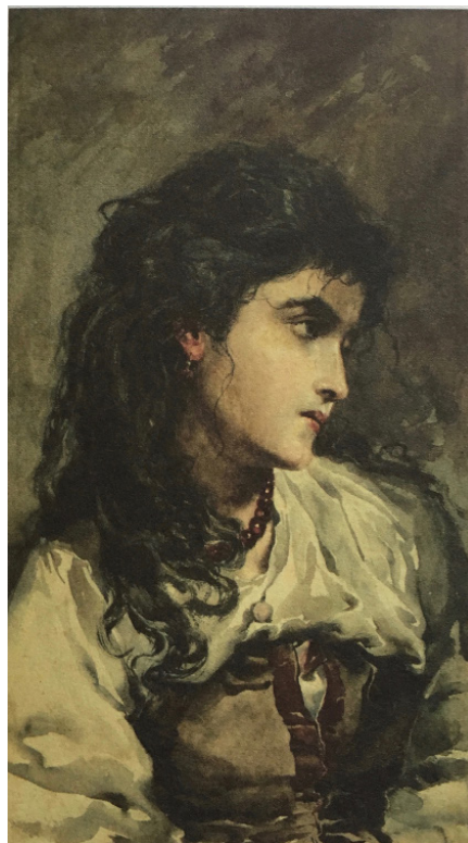
Figure 3: Gipsy , Maria Pia, undated. Watercolour on paper, 45,6x25,3 cm. Inv. PNA 4656