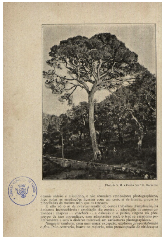
Figure 10: Boletim Photographico with a photograph by Maria Pia, exhibited in the I National Exhibition of Amateur Photographers