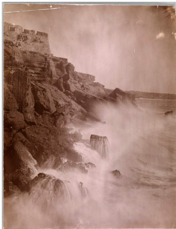
Figure 9: Cascais, Cliffs and Fortification of Guia, Maria Pia, 1894. Gelatin and Silver Print on paper, 20,7 x 15,7 cm. Inv. PNA. 62195

In contrast, the critic of the journal Novidades is very enthusiastic: “Her Majesty the queen Lady Maria Pia has superb photographs, representing the launching of a bridge in Tancos, several stretches of the palace of Cintra, and the beach of Cascais” (A Exposição Nacional de Photographias, 1899, s.p.). And broadly speaking about the work of the royal family, this critic states that they present “magnificent photographs by the sharpness, the distribution of light and by the choice of subject”. The newspaper O Século argues that photography is an art, and includes Maria Pia in the group of artists: “Who will deny that such a wave of the queen’s lady D. Maria Pia (...) are not products of the spirit and exquisite taste, of a temperament of an artist?” (Exposição nacional de photographia, 1900, p. 1).