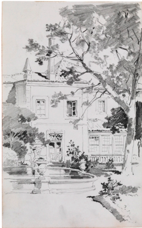
Figure 2: The Palace with a water tank, Maria Pia, 1887-1889. Gelatin and Silver Print on paper, 14 x 22,7 cm. Inv. PNA 58279/19