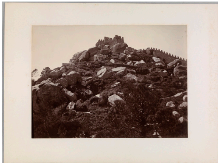
Figure 5: Sintra, The Moorish Castle, Maria Pia, 1893. Gelatin and Silver Print on paper, mounted on a cardboard. Image: 15 x 20,6 cm; Cardboard: 21,3 x 28,4 cm. Inv. PNA 62600

The adoption of the bicycle is one more element that reveals her modern attitude, that is, the taste for technical innovations, that she quickly adopts (Figure 6). Which also reflects her cosmopolitanism (Pallier, 2006; Peacock & Cerqueira, 2007; Lopes, 2011).