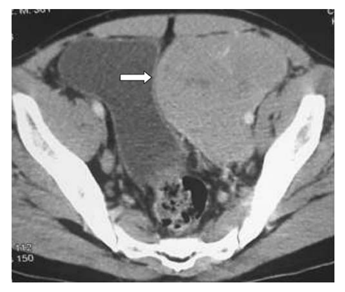
Figure-1: Arrow points at enlarged pelvic lymph node compressing urinary bladder.

Laboratory investigations revealed haemoglobin10.9 gm%, packed cell volume 34.3 %, total leukocytes count