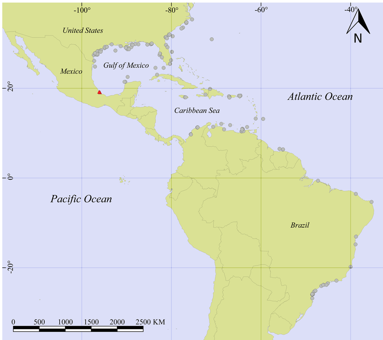
Figure 2. Known distribution of the sea anemone Calliactis tricolor . Gray dots represent previous records; red triangles represent the new records in the southwest Gulf of Mexico, at the Veracruz reef system.

are of different sizes. Pedal disc about 47 mm in its longer diameter.