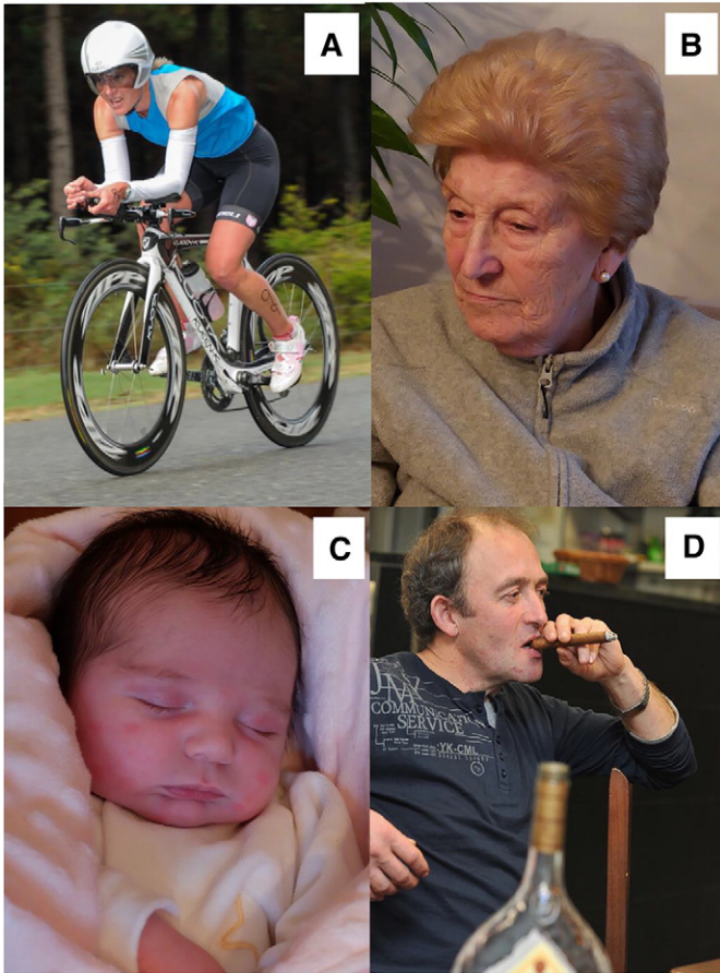
Fig. 1. Four contrasting people subject to varying medical risk factors, illustrating the parallels between prospective medical patients and potentially impaired river ecosystems. Medical doctors use the same general approach, but different sets of indicators in the diagnosis of each patient. For example, a pregnancy test would be relevant only for individual A. Similarly, although all four people could have lung cancer, the probability is much higher for individual D. All four individuals could be subject to a physical performance test, but expectations on healthy performance and future health goals would differ widely. The medical goals would also differ: top physical performance (A), relatively autonomous and painless life (B), early detection of emerging problems (C), and changing risky habits (D).

Differential diagnosis is equally applicable to ecosystems (Fig. 2), where it could be defined as a systematic approach to distinguish, based on unique sets of characteristics, between two or more potential causes of ecosystem impairment that share symptoms. Differential diagnosis starts with broad indicators and progresses using increasingly specific criteria to screen out potential causes of a problem (Box 1). A wide range of indicators has been developed. Examples for river ecosystems (Bonada et al., 2006; Woolsey et al., 2007; Friberg et al., 2011) include some with specific targets, such as diatom indices to reveal impacts of acidification (Van Dam, 1988). However, a general diagnostic framework for selecting indicators to differentiate among multiple causes of ecosystem impairment is lacking. Many indicators (e.g. macroinvertebrate community structure) have been developed to provide an integrated assessment of general ecological state, and therefore offer little diagnostic power. First steps have recently been made towards establishing a differential diagnosis approach to river assessment (Elosegi and Sabater, 2013), but clearly more development is required in theory and practice. This includes integration of both the structural and functional dimensions of ecosystem condition (Bunn and Davies, 2000; Gessner and Chauvet, 2002) in a systemic perspective.