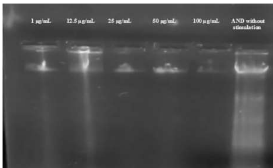
Figure 2: Genotoxicity in agarose gel electrophoresis for compound 23

Also, compound 23 showed no genotoxicity at significant doses administered in agarose gel electrophoresis (Figure 2).