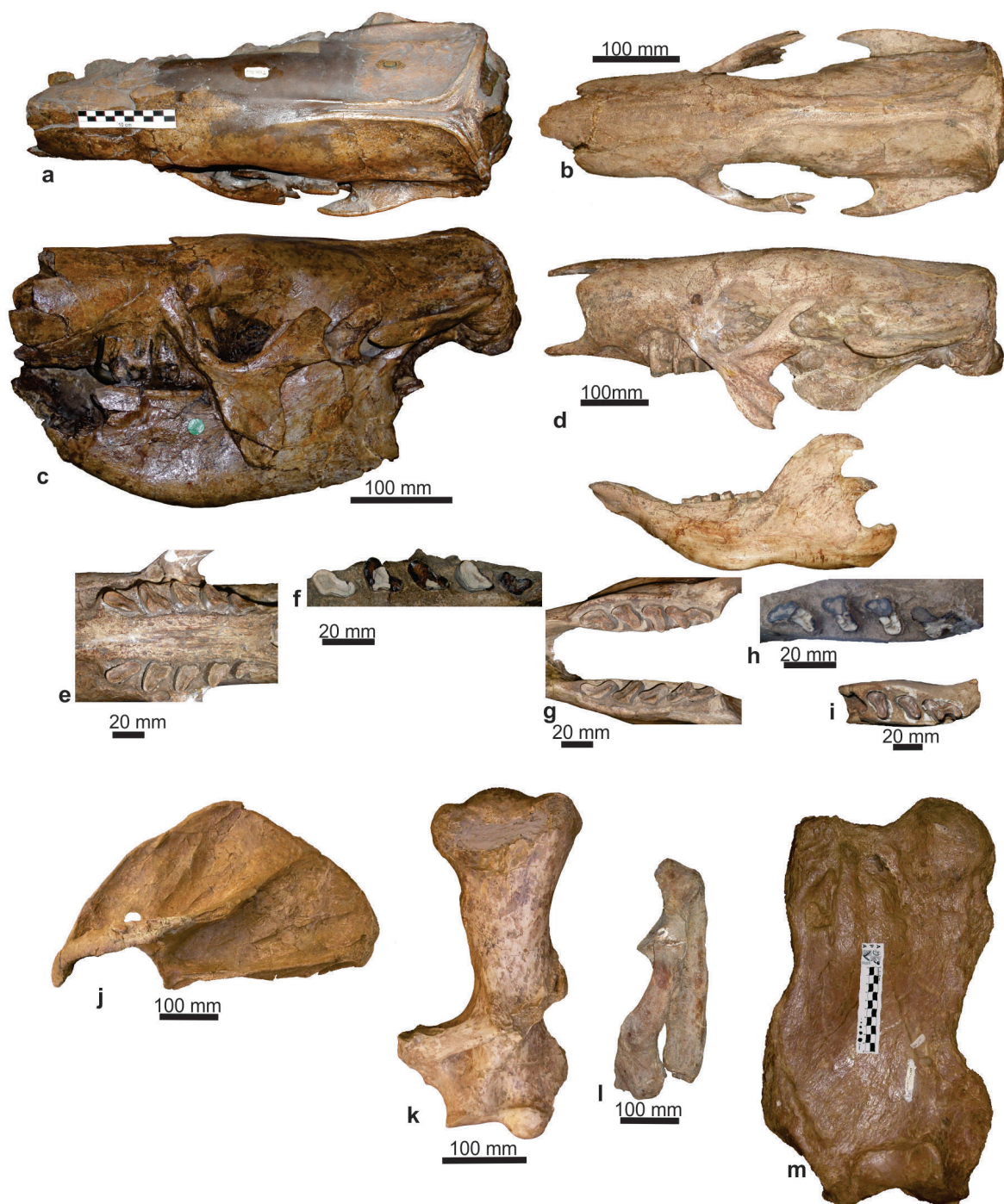
Figure 1 - Catonyx tarijensis (Gervais and Ameghino 1880), a ) skull in dorsal view (MNHN TAR 1260, holotype of Scelidotherrium tarijense ); b ) skull in dorsal view (FMNH P 14243); c ) skull and mandible in lateral view (MNHN TAR 1260, holotype of Scelidotherrium tarijense ); d ) skull and mandible in lateral view (FMNH P 14243); e ) upper dental series in occlusal view (FMNH P 14243); f ) left upper dental series in occlusal view (MNPA-V n/n, ex MUT 452, juvenile); g ) lower dental series in occlusal view (FMNH P 14243); h ) right lower dental series in occlusal view (MNPA-V n/n, ex MUT 451, juvenile); i ) right lower dental series in occlusal view (MNPA-V n/n, ex MUT 438, juvenile); j ) left scapula in lateral view (MNPA-V 005752); k ) left ulna and left radius in lateral view (FMNH P 14238); l ) left humerus in anterior view (MNPA-V 005752); m ) right femur anterior view (MNPA-V 005764).