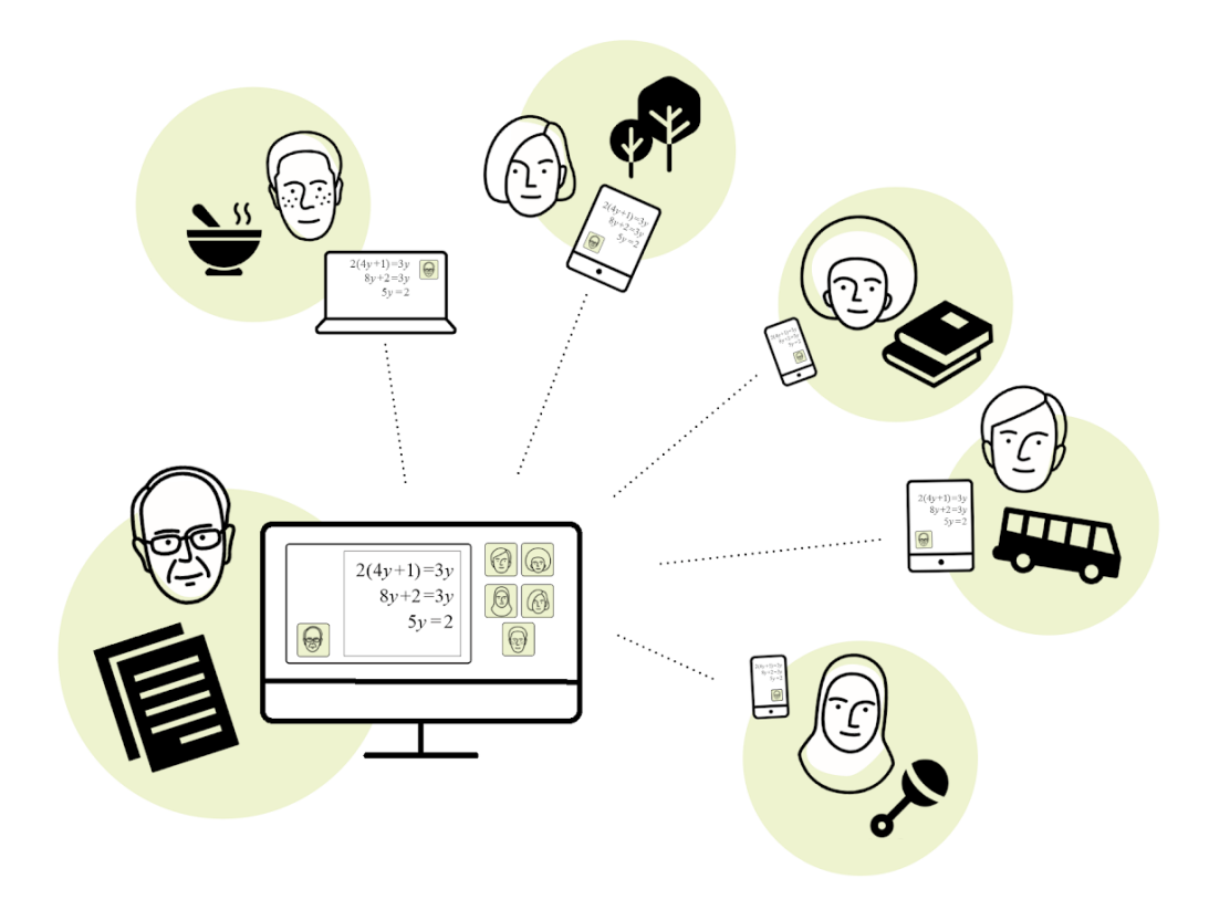
Figure 1. Graphical model of virtual office to demonstrate the adaptability of student schedules.

session due to time conflicts. These sessions were held for the following courses -Thermodynamics, Fluid Mechanics and Heat Transfer.