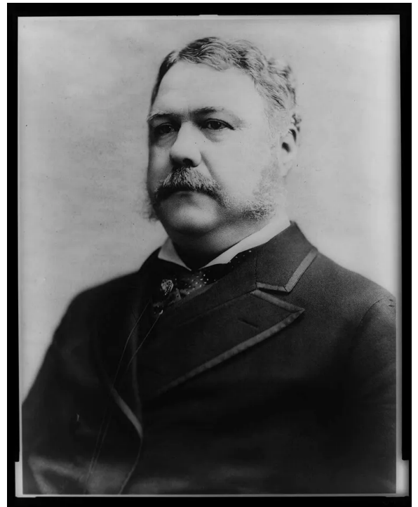
Safeguards began making the federal workforce more neutral when Chester Arthur was in the White House.