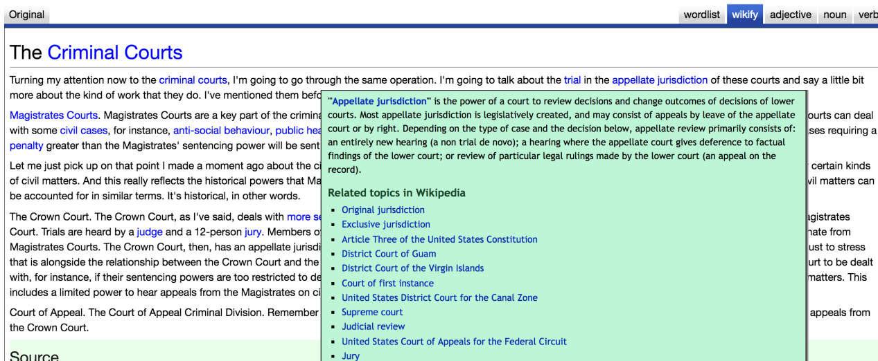
Figure 6. A definition of appellate jurisdiction from Wikipedia in the Wikipedia view

The process of relating words and phrases running text to Wikipedia articles is called “wikification,” and Milne and Witten (2013) describe the method we use. It has three steps. First, sequences of words in the text that may correspond with Wikipedia articles are identified using the names of the articles, as well as their redirects and every referring anchor text used anywhere in Wikipedia. Second, situations where multiple articles correspond to a single word or phrase are disambiguated. For example, the word kiwi may refer to a bird, a fruit, a person from New Zealand, or the New Zealand national rugby league team, all of which have distinct Wikipedia entries. A machine learning classifier is used to make the appropriate choice, taking into account the prior probability of the mapping, semantic relatedness to other concepts in the same document, and some contextual information. The third step selects the most salient linked (and disambiguated) concepts to include in the output. Again a learning approach is used that combines prior probability, relatedness to context, disambiguation confidence, generality, location and spread. All this, including the machine learning methods and models, is described by Milne and Witten (2013).