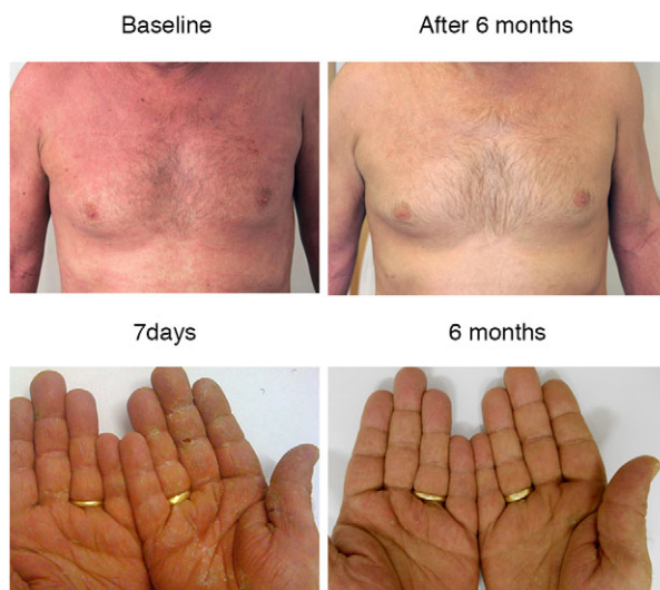
Figure 4 Outcome of a treatment regimen based on topical corticosteroids, tacrolimus and emollients.