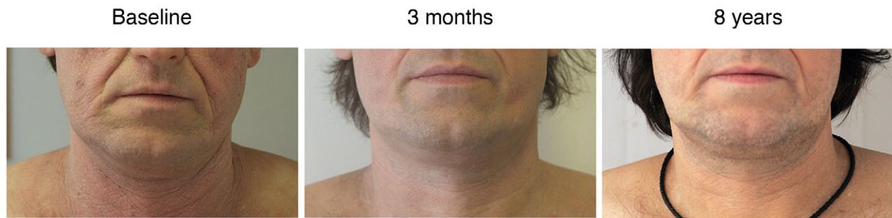
Figure 3 Short (3 months) and long (8 years) outcomes of treatment with tacrolimus ointment in a patient with erythrodermic atopic dermatitis.