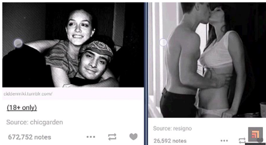
Figure 3. Desiring bodies.