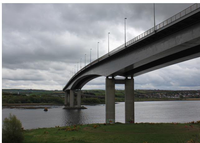
Figure 2 The Foyle Bridge (Our Future Foyle 2016)

Combined consideration of these geographical, social and historical factors have been crucial in building co-design relationships with Derry/Londonderry communities and addressing how the project is presented to the community and how consultation will engage.