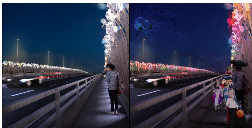
Figure 6 Proposed ‘Foyle Reeds’ light installation on the Foyle Bridge showing daily and special event adaptation (Our Future Foyle 2017)

All five of these design proposals directly involve the communities of Derry/Londonderry in their development, and as much as feasibly possible, the building and delivery of the proposals, ensuring a community led initiative that can proudly announce that it was conceived, built and delivered in the city for the city.