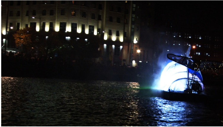
Figure 5 ‘Dopey Dick’ on the river for Halloween celebrations

It should be noted that the consultations and activities did not directly discuss the issue of suicide. Participants did comment on incidents and the area’s association with suicide behaviour but it was decided that this would not directly be addressed during these public engagements, so that the tone of the event remained positive and highlighted opportunities for future development around the River Foyle. The key question asked at these events was ‘what do you want your riverfront to become?’