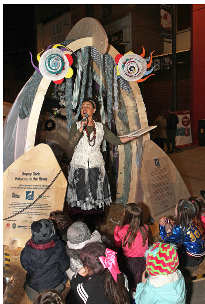
Figure 4 Dopey as community performance space (Our Future Foyle 2016)

Derry/Londonderry is also known locally as 'LegenDerry' and this status is reflected in the cities world-renowned status for hosting Halloween celebrations. Dopey would return, this time as the 'Ghost of Dopey Dick' and set up in the city centre for four days over the Halloween weekend. During this event an estimated 3,000 people visited the research space, and consultations were extended to include video interviews and recorded 'voxpops' of people's thoughts about the river and the opportunities it may present. During the Halloween event, the space also became a central point for community activities and performances including a choir, poetry recitals (Figure 4) and a music performance.