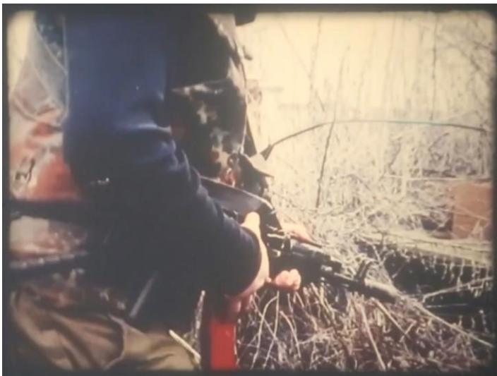
Figure 1. Bear in the trench.

Drawing from this experience, I made a 16mm film, patrol (Ploeger 2017) 1 , which consists of footage I recorded with my smartphone during the trip and subsequently transferred to celluloid film. It shows fragments of my foot journey with three soldiers, known under their noms de guerre as Bear, Carpenter and Steinar. The two-minute long film shows how we move from a safe house on the edge of the no man's land to a frontline outpost opposite a separatist position, while installing a communication cable through an unfinished trench (figure 1).