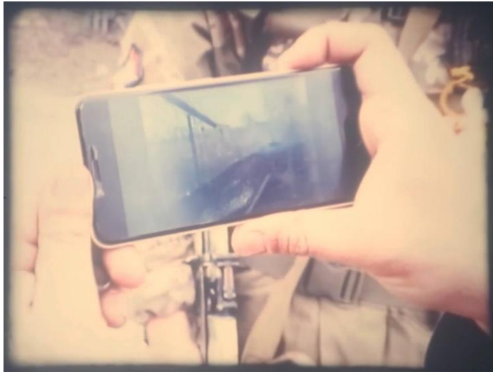
Figure 3. Steinar and Carpenter showing a video of their explosion on a smartphone.

break. Shortly after, they return and proudly show us a video of the explosion on one of their smartphones (figure 3).