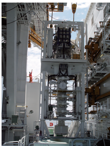
Figure 2. External view of Chikyu 's blow out preventer (BOP). BOP hangs from riser pipe attached to high-powered winches on ship's derrick and will be deployed onto seafloor through moonpool below drilling platform. Note person on left for scale.

Following completion of the drilling and laboratory tests off Shimokita Peninsula in the fall of 2006, D/V Chikyu will embark on an