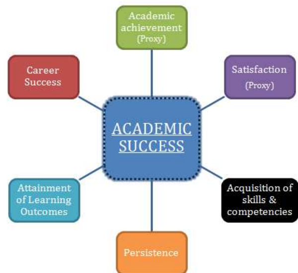
Figure 2. York, Gibson, & Rankin Revised Conceptual Model of Academic Success

A revised definition and model. It is with this critique in mind that we present an amended definition and conceptual model of academic success (Figure 2). Based on our findings we define academic success as inclusive of academic achievement, attainment of learning objectives, acquisition of desired skills and competencies, satisfaction, persistence, and post-college performance.