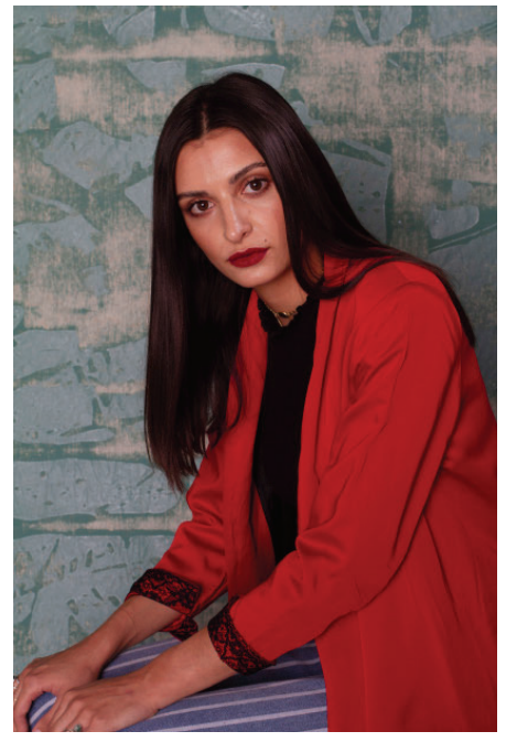
29. Volume 3 Issue 2