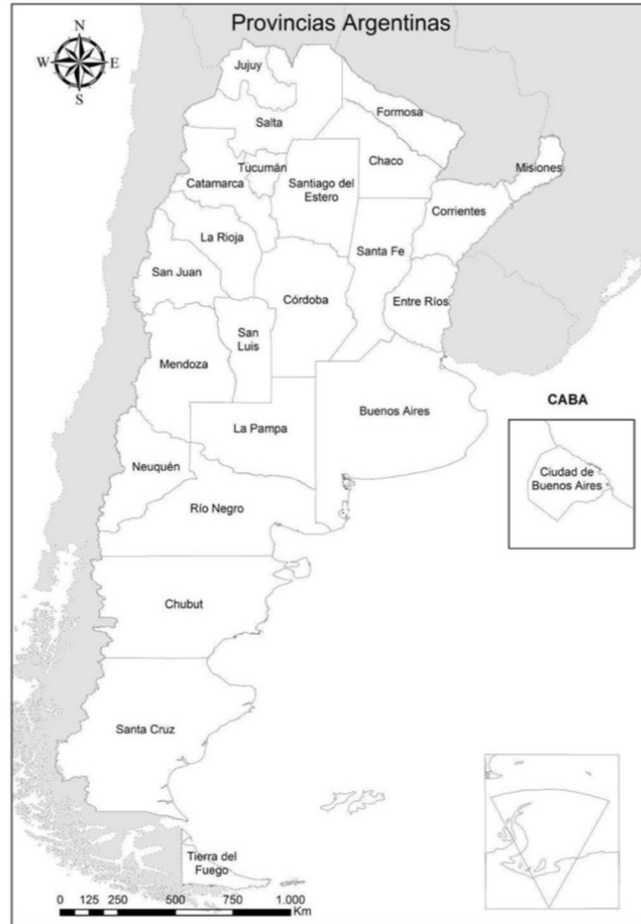
Mapa 1: República Argentina, según división político-territorial (provincias)

urban nodes and even less populous tertiary settlements. As extractive economic practices begin to play a larger role in the national economy again, these secondary and tertiary cities have taken on new roles vital to the productivity of the entire system, while relying heavily on particular industries for their self-sufficiency.