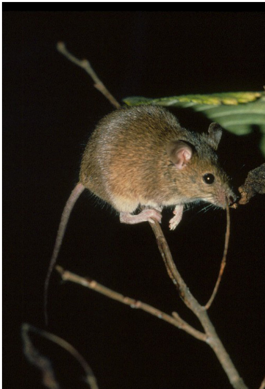
Figure 3. House mouse ( Mus domesticus , M. musculus ; source of photo unknown).

The commensal rodents include the Norway rat ( Rattus norvegicus ; Figure 2), the ship or black rat ( R. rattus ), the Polynesian rat or kiore ( R. exulans ), and the house mouse ( Mus musculus and M. domesticus ; Witmer and Shiels 2018; Figure 3). These species live in close proximity to humans, exploiting the favorable conditions that are created for them. Concomitantly, all the species except the Polynesian rat have spread throughout most of the world and now cause significant losses of stored foodstuffs through consumption and contamination as well as increased human health and safety concerns (Meerburg et al. 2009, Witmer and Shiels 2018). Additionally, they have also been especially damaging to insular ecosystems when introduced to islands (Angel et al. 2009, Witmer and Pitt 2012).