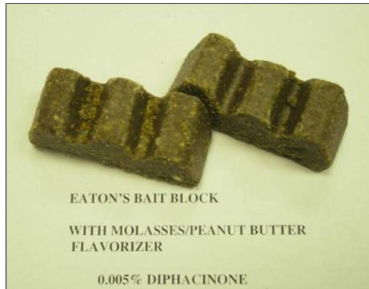
Figure 4. Rodenticide bait block (photo courtesy of U.S. Department of Agriculture).