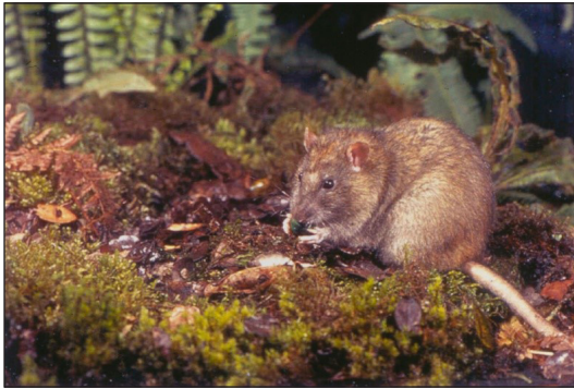
Figure 2. Norway rat ( Rattus norvegicus).