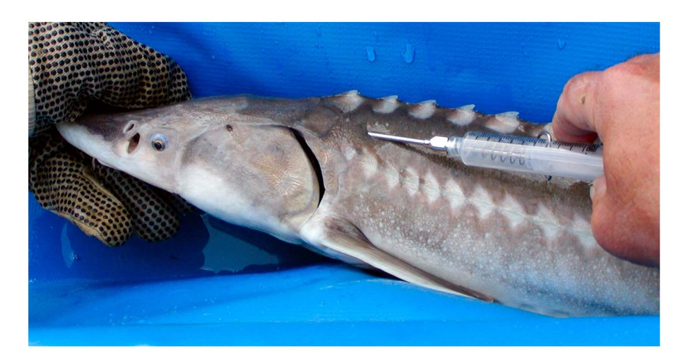
Figure 4. Illustration of the preferred location of PIT tag application on a juvenile White Sturgeon. The PIT tag is injected just beneath the skin, about 1 cm behind the head plate, on the left side of the dorsal scute line. doi:10.1371/journal.pone.0071552.g004

identified the timing and location of spawning, a topic of obvious interest to those working on conservation of sturgeon. These studies have relied on both acoustic and radio tracking, often in combination, and typically have made use of mobile tracking to detect tagged sturgeon. A related type of study examines the movement and habitat use of cultured sturgeon after release.