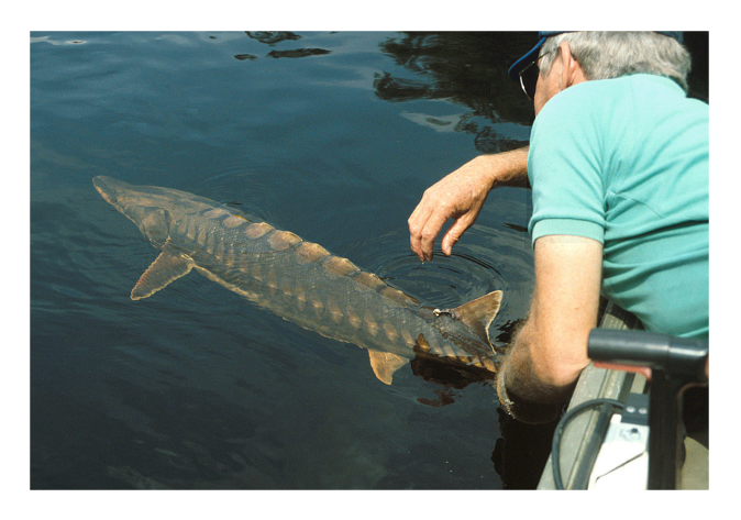
Figure 1. Gulf Sturgeon ( Acipenser oxyrinchus desotoi ). Photo: Joe Hightower. doi:10.1371/journal.pone.0071552.g001

Sturgeons may move from one location or habitat type to another to feed, reproduce, or overwinter. River movement can be complex and include multi-step migrations [10] and include movement between and among rivers suggesting a meta-population structure [11]. Within a species, populations can differ on the timing of migrations into river systems, time spent within the river (holding), and the distance (upstream) from the marine environment where spawning occurs. Directed migrations from overwintering locations to feeding habitats, in some cases timed to intercept specific, localized prey species, may be a population-based behaviour; other populations of the same species may