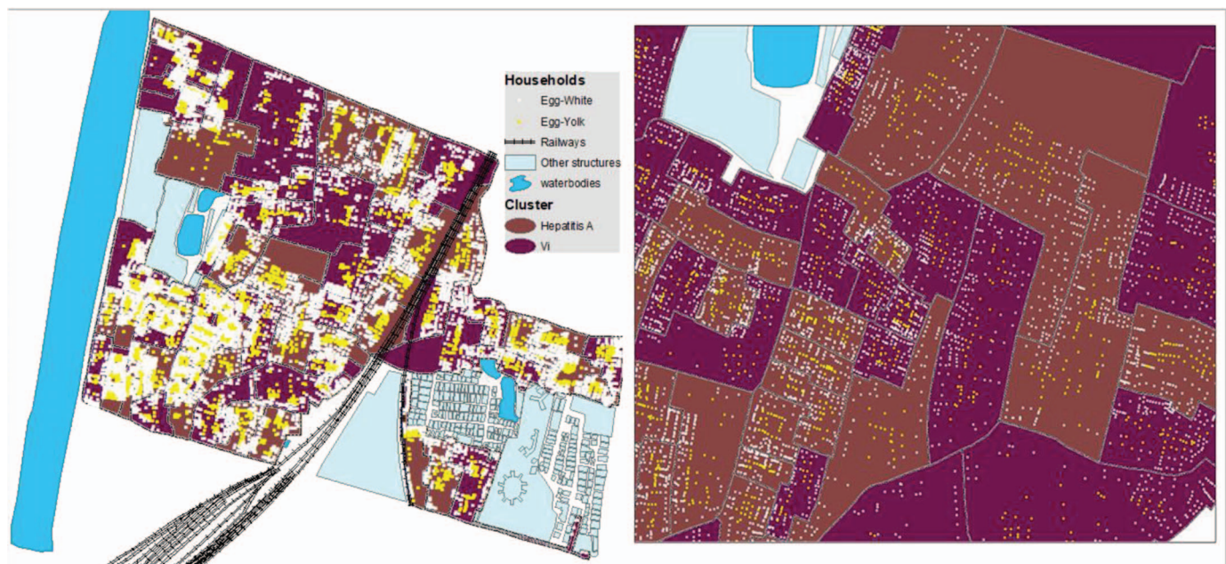
Figure 3. Distribution of study area households (entire study area in the left panel, close-up view of some of the clusters in the right panel) for analyses of the P25 clusters. Note: The yellow dots are the households in the P25 clusters and the white dots represent other households in the entire cluster.

(yes vs no), cluster population density (<median vs \geq median), flush toilet in household (yes vs no), access to a specific place for waste disposal in the household (yes vs no) and distance of household to the nearest treatment centre (<median vs \geq median). Comparisons of these variables between treatment arms employed generalized estimating equations to adjust for membership in the randomized clusters, with the logit link function for dichotomous variables and the identity link function for dimensional variables. 11