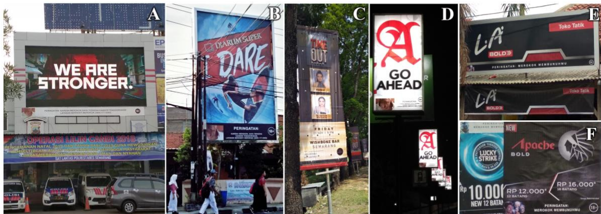
Figure 1. Samples of advertisements by type in Semarang, 2018

Note: A=video board, B=billboard, C=banner, D=neon box, E=store name board, F=poster